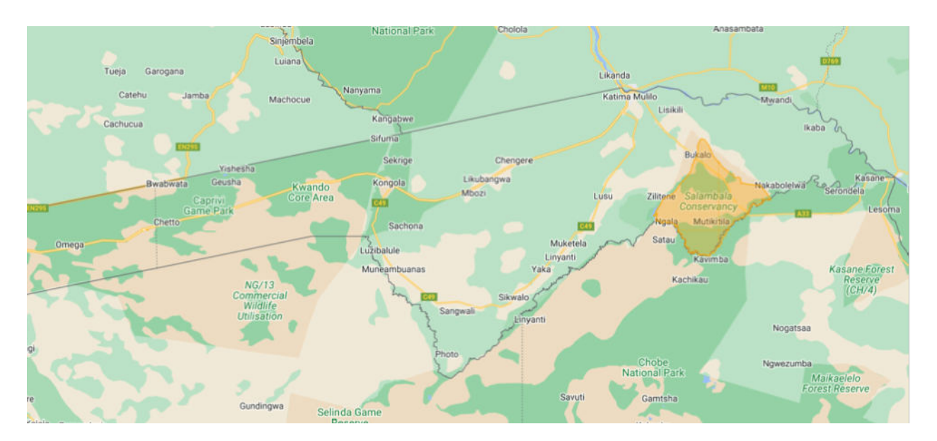
Figure 1. Location of Salambala Conservancy

Salambala Conservancy in located in the southern floodplain of Kabbe South Constituency in Zambezi Region (see Figure 1 & 2). It situated on the northern banks of Chobe Rivers, the border between Namibia and Botswana.