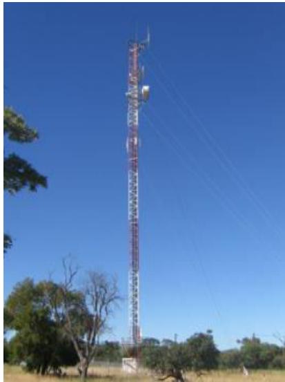
Figure 2: Typical Guyed lattice telecommunication tower structure (for visual purposes only) with guyed anchors for stability.

The site is easily accessible from the C49 road Katima Mulilo – Kongola road, 80km from town. From the C49 main road, the site can be accessed through the village access road to the Linyanti Combined School and constituency office about 2km. The actual site falls under the Linyanti Sub-Khuta in the Mafwe Royal Establishment area. The selection of this site was driven by anticipated network shortfalls affecting mobile users in this area and its surrounding. Furthermore, several selection criteria’s were used to identify the most suitable location for this tower in this village. As the site falls under the Katima Mulilo Rural Constituency, prior engagements have been done with the local authority and the Linyanti Sub-Khuta to request for leasehold agreement, which was later granted to the proponent to use the land for the tower construction. Approval for the tower was formally granted to Telecom Namibia in a letter dated 17 April 2024 ( Appendix C ). Location details are provided in Table 1 below.