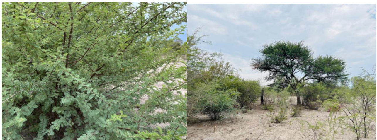
Figure 3: Common vegetation found around the proposed site ( Acacia spp.)

While these species may be common in the rest of Linyanti area, the project site is dominated by thorny acacia bush species . The removal of any vegetation surrounding the site area should therefore be done in a properly managed, planned and responsible manner to avoid the destruction of unnecessary ground cover. The rehabilitation of disturbed areas is important and should be done following the Environmental Management Plan (EMP). Noting the project site and its size, minimal impact on the available flora and environment will be done.