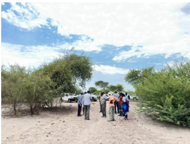
Figure 4: Sandy soil as observed on the project site, Linyanti Village

The geology of Linyanti Village is characterized by its position within the broader Zambezi Basin. The area lies on Quaternary Alluvial Deposits, formed by sedimentary processes from the Linyanti and Zambezi Rivers. These deposits include layers of sand, silt, clay, and organic material brought in by river systems. The potential soil impact in the study area is that the soils in the area are susceptible to wind erosion therefore the disturbance of the soil surface in the vicinity of the project must be minimized to prevent wind erosion. The footprint of the construction area must be kept as small as possible and existing access roads are to be utilized at all times to avoid off-road tracks. The project footprint area should not be cleared entirely and the site should be rehabilitated after the construction phase.