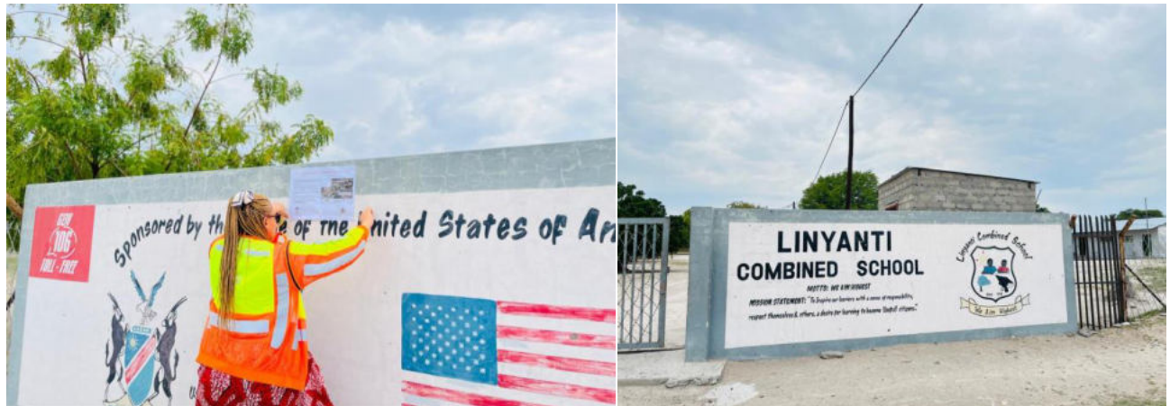
Figure 5: Site Notification, Linyanti Combined School

A site notice (A3) were placed at the local entertainment establishment and the Linyanti Combined School Gate which are close to the site, to inform members of the public of the EIA process and register as I&APs, as well as submit comments. The notices also provided information about the project and related EIA process while providing contact details of the project team.