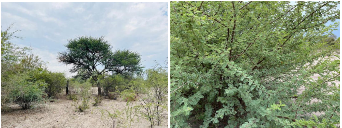
Figure 2: Common vegetation found around the proposed site (Acacia spp.)

The project site is dominated by thorny acacia bush species. The removal of any vegetation surrounding the site area should therefore be done in a properly managed, planned and responsible manner to avoid the destruction of unnecessary ground cover. The rehabilitation of disturbed areas is important and should be done following the Environmental Management Plan (EMP). Noting the project site and its size, minimal impact on the available flora and environment will be done.