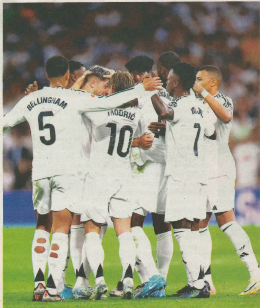
Winning ways... Real Madrid recorded a convincing 2-0 win over Villarreal in the La Liga.