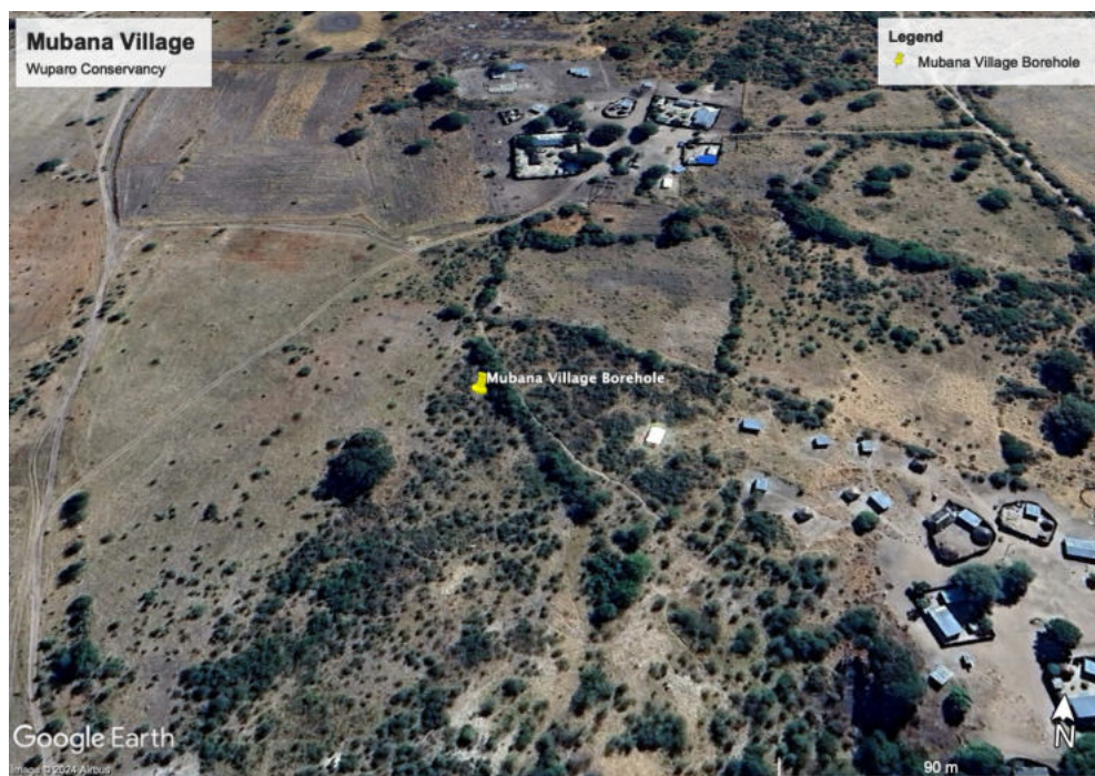
Figure 2. Borehole site at Mubana Village, Wuparo Conservancy