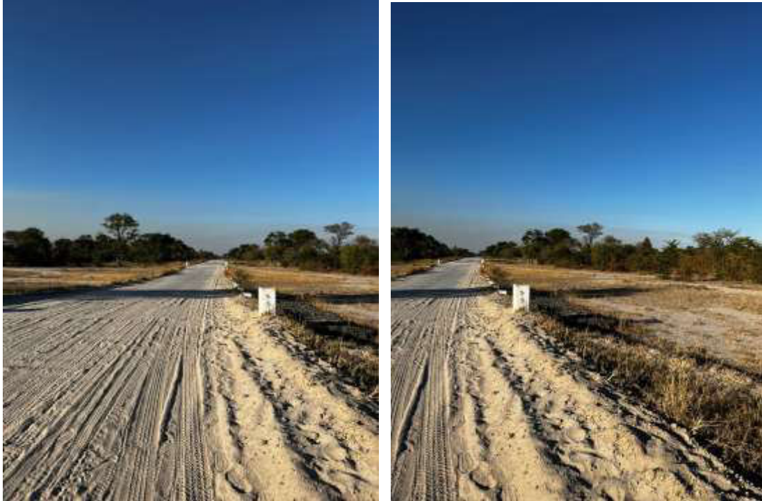
Figure 2: Current condition of DR3521-MAFUTA ROAD, Katima Mulilo

users. Furthermore, the increased traffic volumes lead to higher maintenance costs and generate significant dust. See images below for the current condition of the road. Nonetheless, the upgrading of the road will be implemented based on the availability of funds.