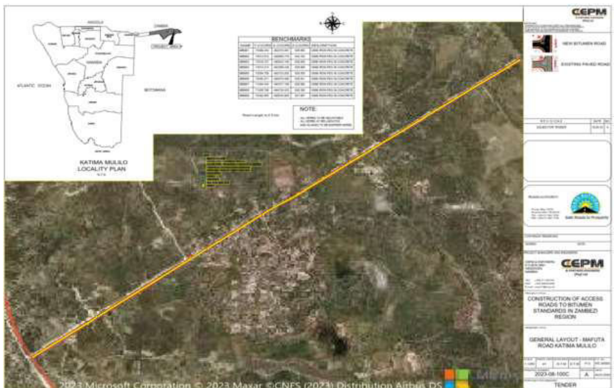
Figure 1: DR3521-MAFUTA ROAD, Katima Mulilo

CEPM & Partners Engineers Pty. Ltd (CEPM) were appointed (14 MAY 2024) by the Roads Authority to offer consultancy services for detailed design, and tender documentation of access roads in & around Katima Mulilo, Zambezi Region. Ritta Khiba Planning Consultant cc appointed by CEPM & Partners Engineers Pty. Ltd (CEPM) as the Environmental Consultants and as Environmental Assessment Practitioners responsible for obtaining environmental clearance for the proposed upgrading and construction of DR3521-MAFUTA ROAD to Low Volume Seal standards in Katima Mulilo, Zambezi Region (see figure 1 for Locality). The implementation of this project would be guided by the Memorandum of Agreement (MoA) signed between the three parties namely: Katima Mulilo Town Council, Roads Authority and Road Fund Administration.