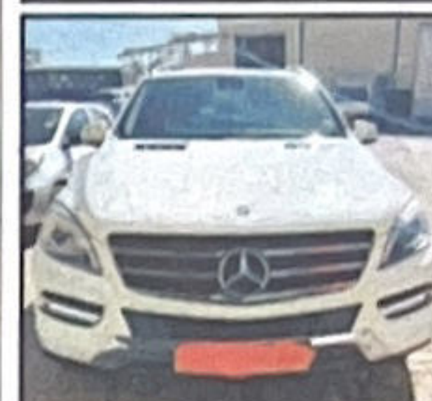
Mercedes Benz ML350 non-runner, Engine problem. Selling as is 0812773830