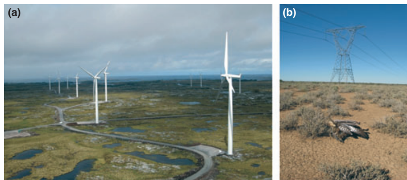
Figure 1. Artefacts that appear conspicuous in the environment to human observers but present high collision risks to birds. (a) Wind turbines on the island of Smøla, Norway. The wind farm covers 18 km 2 and contains 68 turbines. Each wind turbine is 70 m high and has a rotor blade diameter of 83 m. They are the only large obstacles in an otherwise open landscape (vehicles near the bases of the turbines provide scale). Between 2003 and 2009, 24 species of birds were recorded to have collided fatally with these turbines. Willow Ptarmigan Lagopus lagopus and White-tailed Eagle Haliaeetus albicilla were the most frequent casualties (May et al. 2010). Observations of the behaviour of birds at this site led to the conclusion, 'Preliminary data suggests White-tailed Sea Eagles show no tendency to avoid turbine blades, treating them as if they are not there' (Halley et al. 2010). (b) Power lines in the Karoo region of South Africa. Although these power lines appear very conspicuous to human observers in these open habitats, bustards and Blue Cranes Anthropoides paradiseus are particularly vulnerable to collisions with these artefacts (Shaw 2009, Jenkins et al. 2010).

Many bird species are prone to collisions with static artefacts that to humans appear conspicuous, especially when they extend into the open airspace above vegetation. Structures such as power lines, fences, communication masts and buildings have long been recognized as posing major problems for certain bird species both in locations where the object may be partially obscured by vegetation, as