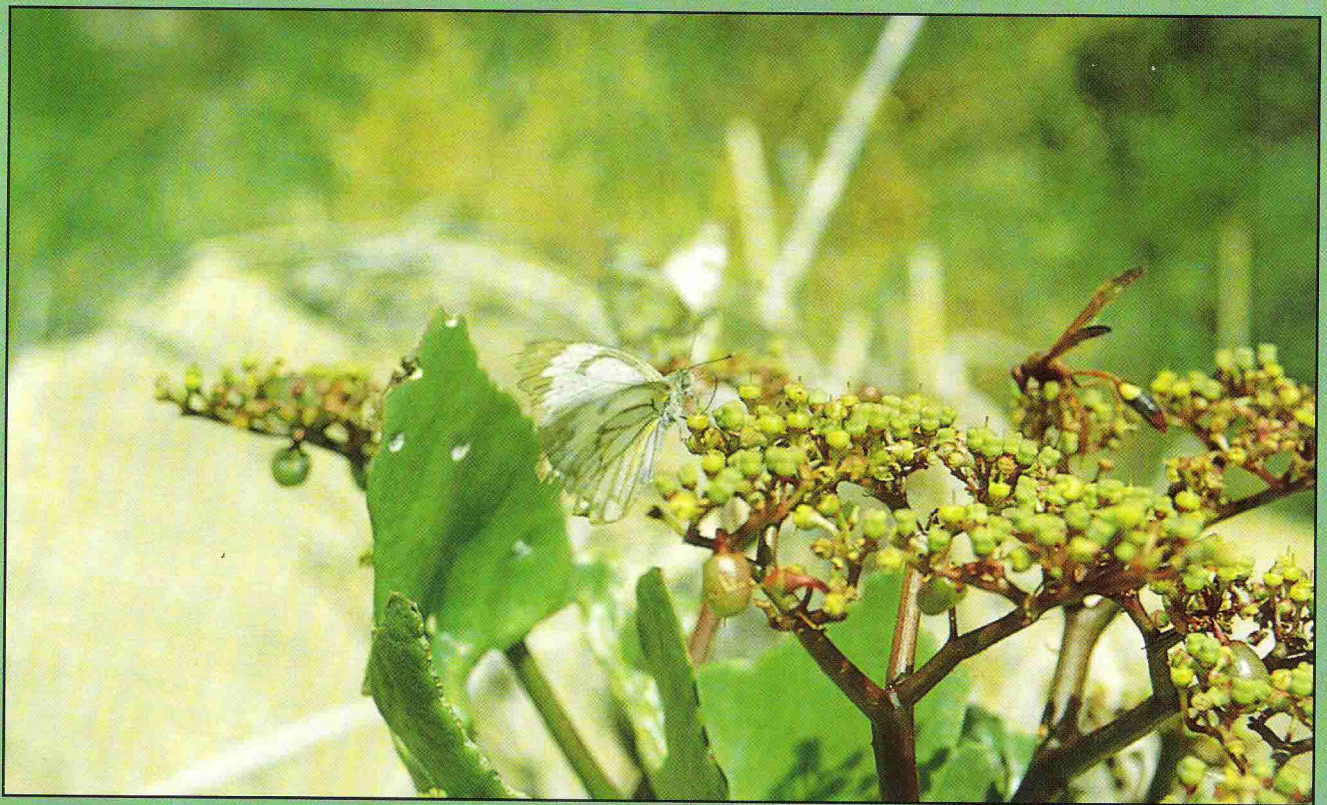
Top: A colourful caterpillar enjoys its meal of lily leaf. Above: A migratory butterfly (Belenois aurota) and Mason wasp (Delta caffer) visit flowers of the stem-succulent Cyphostemma bainesii.

species is one natural way of controlling insect pests. To leave at least parts of natural vegetation in the surrounding areas of crop land provides habitats for natural enemies of crop pests and another