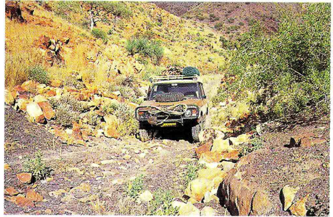
A steep ascent to the plateau on the 4x4 trail.

Several field seasons later, we still have not covered the massive mountain entirely, but we expect the continuing research to explain the environmental factors determining the distribution and composition of this distinctive mountain flora. The total analysis of the distribution range of all plant species found in the Naukluft Mountains will give an indication of climatic conditions in the past and subsequent