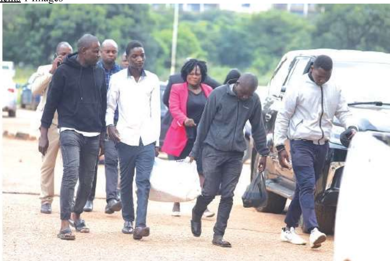
Suspected elephant poachers arrive at the Harare

Magistrates Court carrying their loot yesterday.