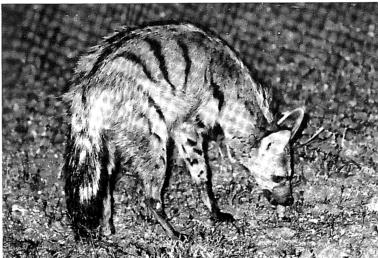
PLATE 2: Aardwolf feeding. Ears are pulled back and face sideways.