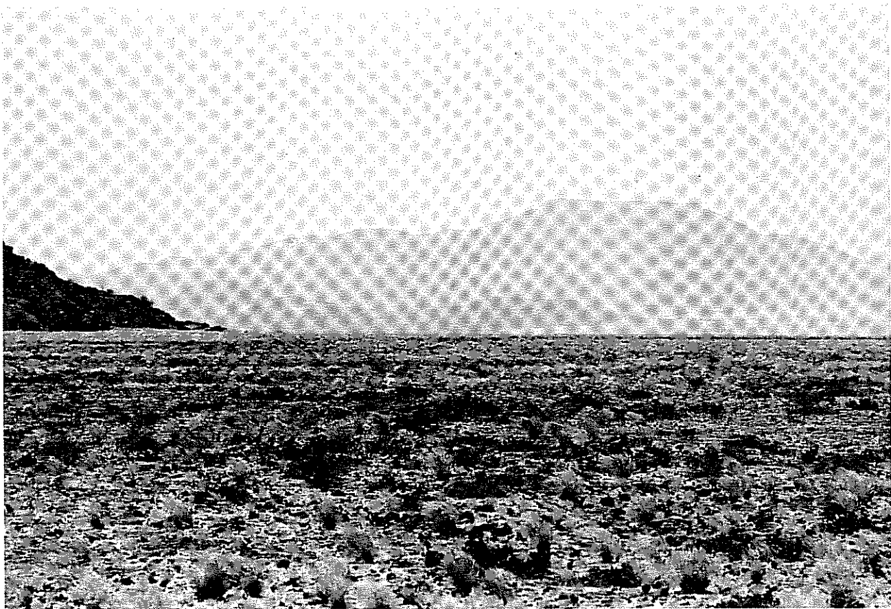
PLATE 3: Aardwolf habitat, looking SW towards Heinrichsberg.