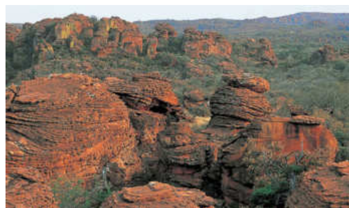
Fossilized dunes at Waterberg

Mount Etjo and Waterberg are the largest of a number of Karoo-age inselbergs occurring south of the Waterberg Thrust - a 250 km-long fault line extending from Grootfontein to Omaruru, along which older Damara rocks (~600 m. y.) were pushed over younger Karoo sediments, with a vertical displacement of at least 700 m. They consist of rocks deposited in the Omingonde Basin of northern Namibia between 220 and 180 million years ago, where under semi-arid conditions some 700 m of conglomerates, sandstones and mudstones accumulated, and were topped by the aeolian Etjo sandstones, which bear witness of a true desert climate. Apart from a variety of dune forms, the Etjo Formation also contains deposits of periodically wet interdune flats and valleys. Rainwater seeping into the porous Etjo sandstone reappears in numerous springs at the boundary between the sandstone and the dense mudstones, which gave the Waterberg its name.