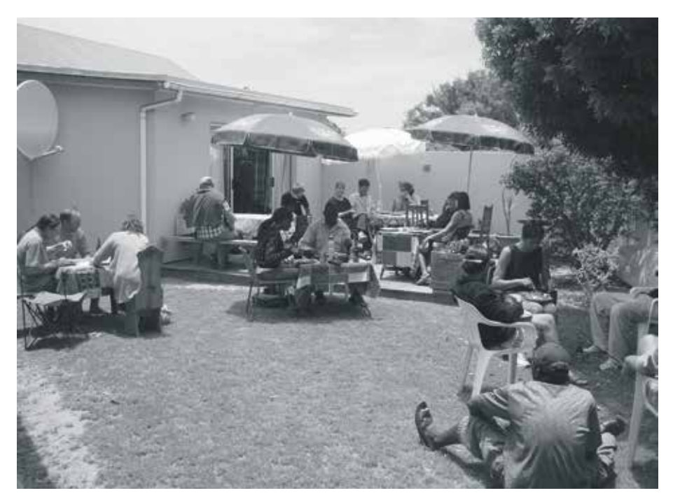
Sunday lunch in the Wearnegarden after the count - July 2009

In January 2009 the author took over the organisation of the counts. He and the bird-counters survived the transition and he is still organising this biannual