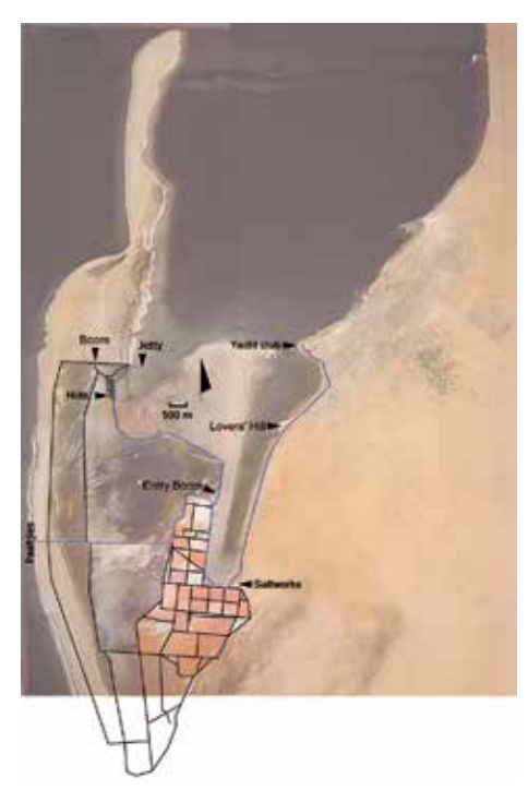
Map of whole point from poster with count outline

In December 1976, birding enthusiasts from the Western Cape Wader Study Group, Cape Town, undertook An ornithological expedition to the Namib coast. The group counted the birds between Sandwich Harbour and Cape Cross. Almost a year was spent planning the trip for the party of 11 from Cape Town on a budget of R585. Two participants from the Division of Nature Conservation and Tourism of the South West Africa Administration assisted with the survey. This first small step in the Walvis Bay wetland laid the foundation for the counts that followed continuously for 30 years. This paper documents the origin of the counts, reasons for them and pays tribute to the many people who made it possible.