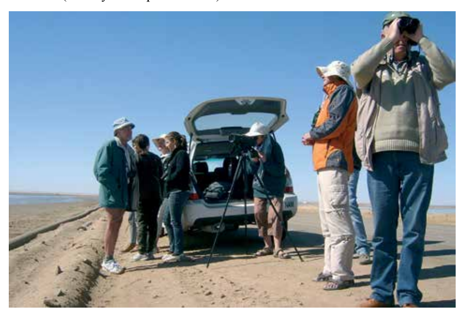
Counting on the Paaltjies Road