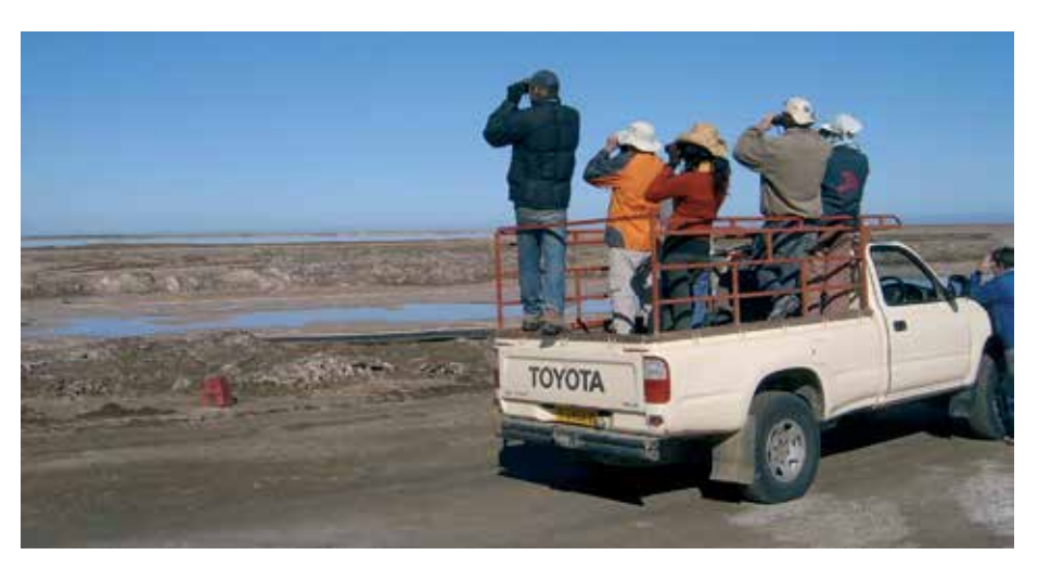
Volunteers counting birds