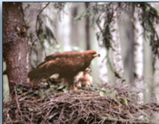
Female Greater Spotted Eagle with nestling.

few weeks after embarking on their autumn migration, in Ukraine and Albania respectively. One adult female was in all probability shot in the Lebanon, and another evidently died in spring 1997 near Lake Nasser in Egypt.