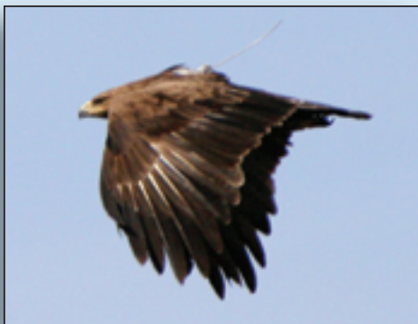
The female Greater Spotted Eagle with PTT 08138 six years after fitting the transmitter at her breeding ground, Biebrza National Park, Poland, 3 April 2005.

The GSEs we tracked flew to at least five countries (Chad, Central African Republic, Tanzania, Zambia, Malawi) from which there