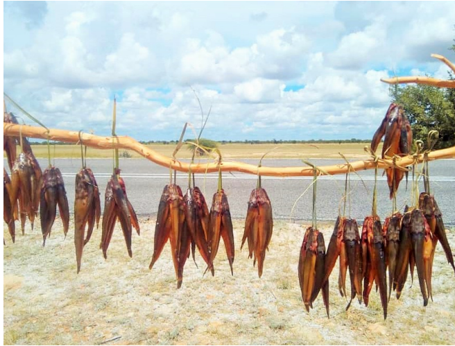
Figure 2: Two barb species (Enteromius spp.) or oontangu (Oshiwambo) that form the main composition of the efundja catch together with catfish. These barbs are also the reason for the extremely fast growth of catfish that feed on them, reaching a length of 30 cm from December (when they hatched) to April.