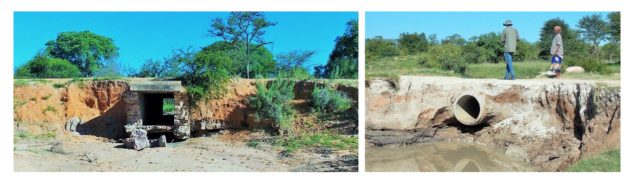
Figure 7: Two examples of inappropriately designed and seriously eroded culverts on the road near the divide, that actually overtopped during a flash flood early in the 2020 rainy season. All smaller fish and most larger fish would have great difficulty getting across these obstacles

Furthermore, the Cuvelai drainage presents a good example of the need of cooperation between neighbouring states. The survival and continuation of fish resources in the interior of the iishana system in both southern Angola and northern Namibia is dependent on the protection and conservation of fish refugia populations in the Cuvelai River itself, the existence of deep dams and pools and especially on the maintenance of connectivity between the Kunene and iishana . It is of utmost importance that these shared water and fish resources are jointly conserved and that harvesting of the fish resources is planned and regulated.