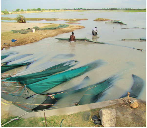
Figure 6: Nine funnel nets just below a culvert intercept fish migration, with a second and third row behind them, efundja 2008.