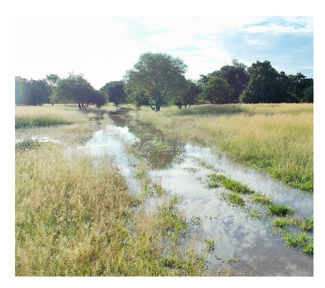
Figure 5: On the divide between the Kunene and Cuvelai catchments, facing the Kunene, February 2020. Fish can reach these shallow standing pools if there is enough rain, and thus move into the iishana, breed and populate them.

The Cuvelai iishana system is a unique ecosystem that is driven by cycles of rain and flood water. While the ancient connection with the Kunene remains intact, fish can enter the system. Fish are a valuable benefit of efundja . The whole system is however threatened by environmental degradation in the iishana region and inappropriate road infrastructure is a constraint (Figure 7).