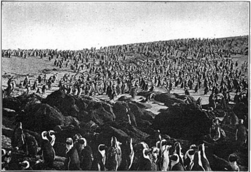
BLACK-FOOTED PENGUINS ON DASSEN ISLAND, SOUTH AFRICA

On the coasts of South Africa only one species is met with. This is the Black-footed or Jackass Penguin ( Spheniscus demersus ) which makes up in numbers for the lack of variety. It is found everywhere along the coasts from the southern