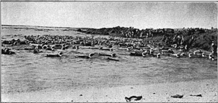
FLOCK OF PENGUINS ABOUT TO LAND ON THEIR NESTING ISLAND

The breeding season of the main body of the Penguins is in May and June (midwinter in South Africa), though eggs and young at all stages can be found the whole year round so that the time of our visit was not very favourable for seeing the island really covered with birds. Between May and August the eggs are collected and shipped to Cape Town for sale and the birds are not allowed to sit until the beginning of September. These islands and the other Bird islands round the coast of Cape Colony belong to the Government and are each placed under the charge of a headman. During the egg season a number of additional men, hired for the purpose by the headman, march across the island in different directions each