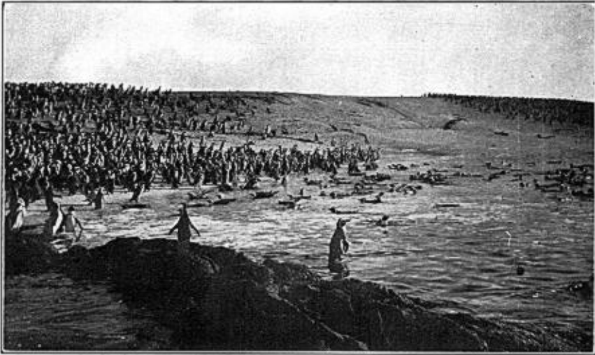
BLACK-FOOTED PENGUINS ON THE SHORES OF DASSEN ISLAND, SOUTH AFRICA

The eggs are usually two in number, though sometimes one, sometimes even three