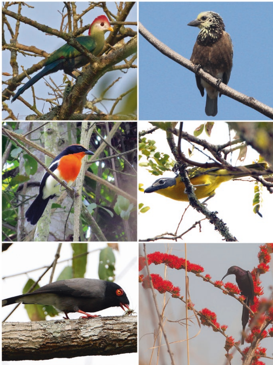
Fig. 14.2 Some special birds of Angola. Top to bottom, left to right: Red-crested Turaco, the endemic national bird of Angola. (Photo: Lars Petersson); Anchieta's Barbet, a sought-after species with a range extending to the DRC and Zambia but best seen in Angola. (Photo: Maans Booysen); Braun's Bushshrike, an endemic restricted to the forests of the northern escarpment. (Photo: Fiona Tweedie); Monteiro's Bushshrike, a difficult-to-see endemic associated primarily with the central escarpment. (Photo: Tasso Leventis); Gabela Helmetshrike, an endemic that occurs primarily at the base of the central escarpment, as in Quiçama NP. (Photo: Tasso Leventis); Bocage's Sunbird is only present in the highlands of Angola and the southwest of the DRC. (Photo: Alexandre Vaz)