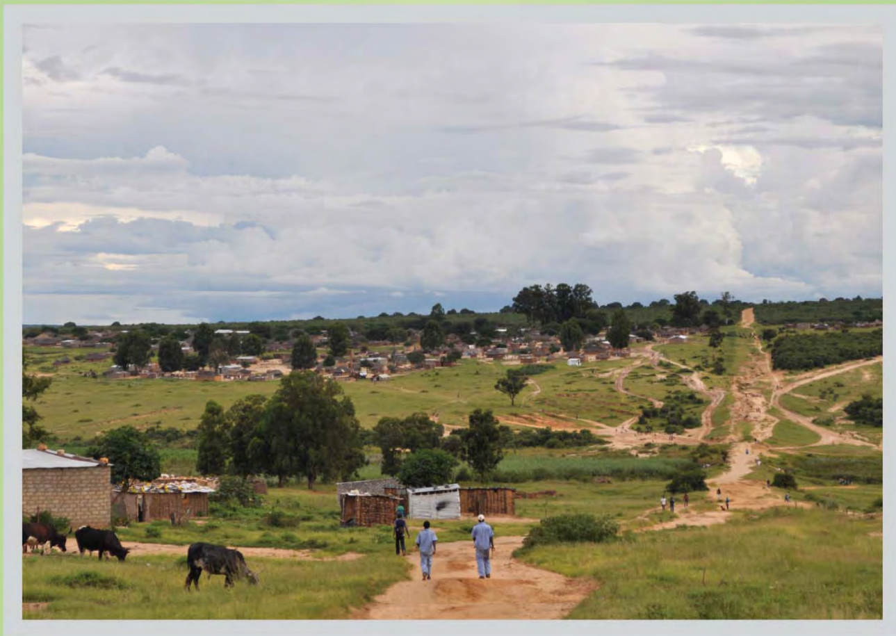
Cuito Cuanavale, Angola