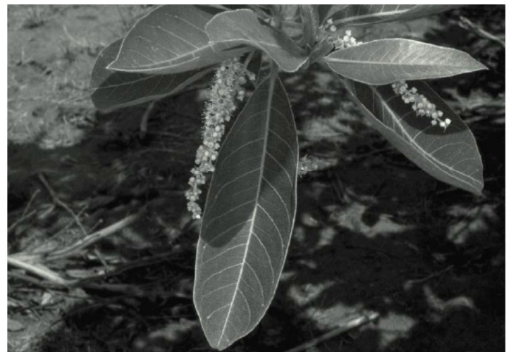
Terminalia trichopoda , B. Curtis