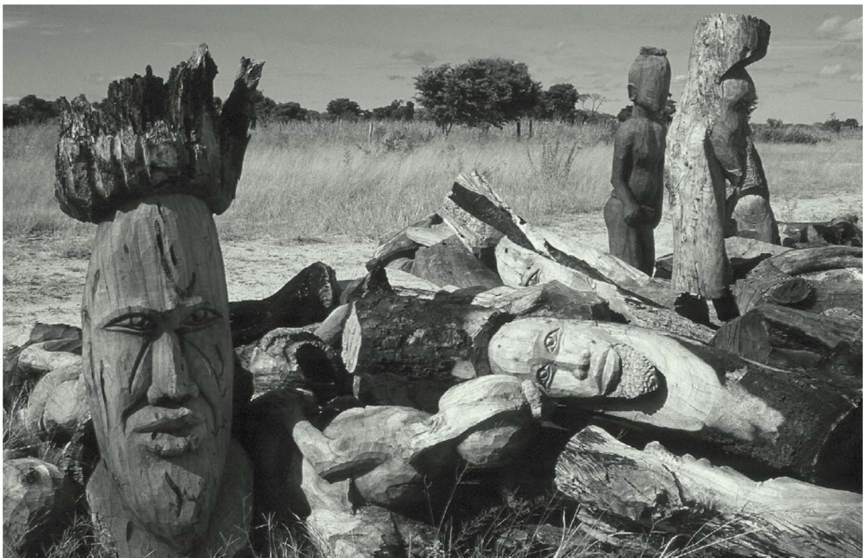
Wood carvings, P. Reiner