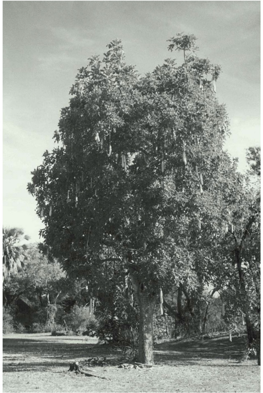
Top right: Kigelia africana , tree with fruit, B. Curtis