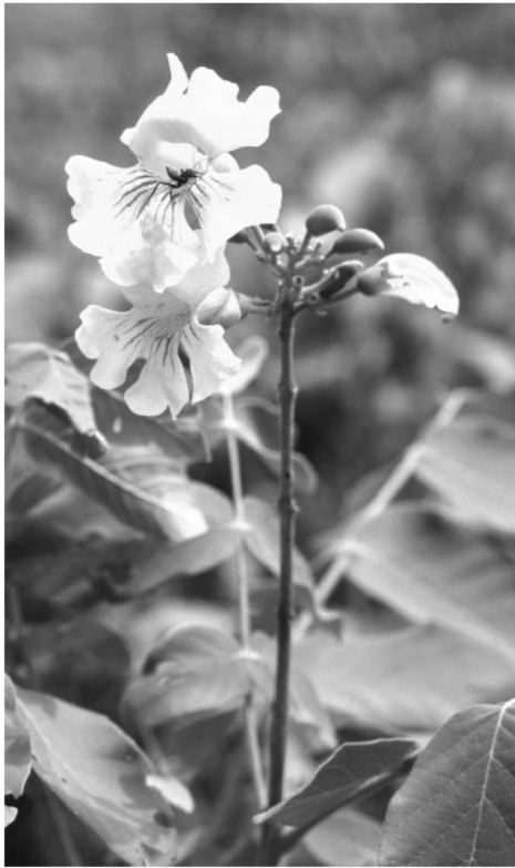
Top left: Markhamia obtusifolia , C. Hines

This family of shrubs, trees and lianas generally has large, compound leaves. The large, showy flowers are bell- or trumpet-shaped, with the corolla tips free and curled backwards. The fruit are generally long, narrow, dehiscent pods or large berries.