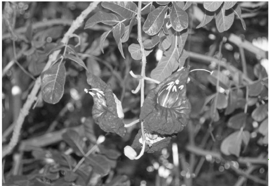
Right: Kigelia africana, flower