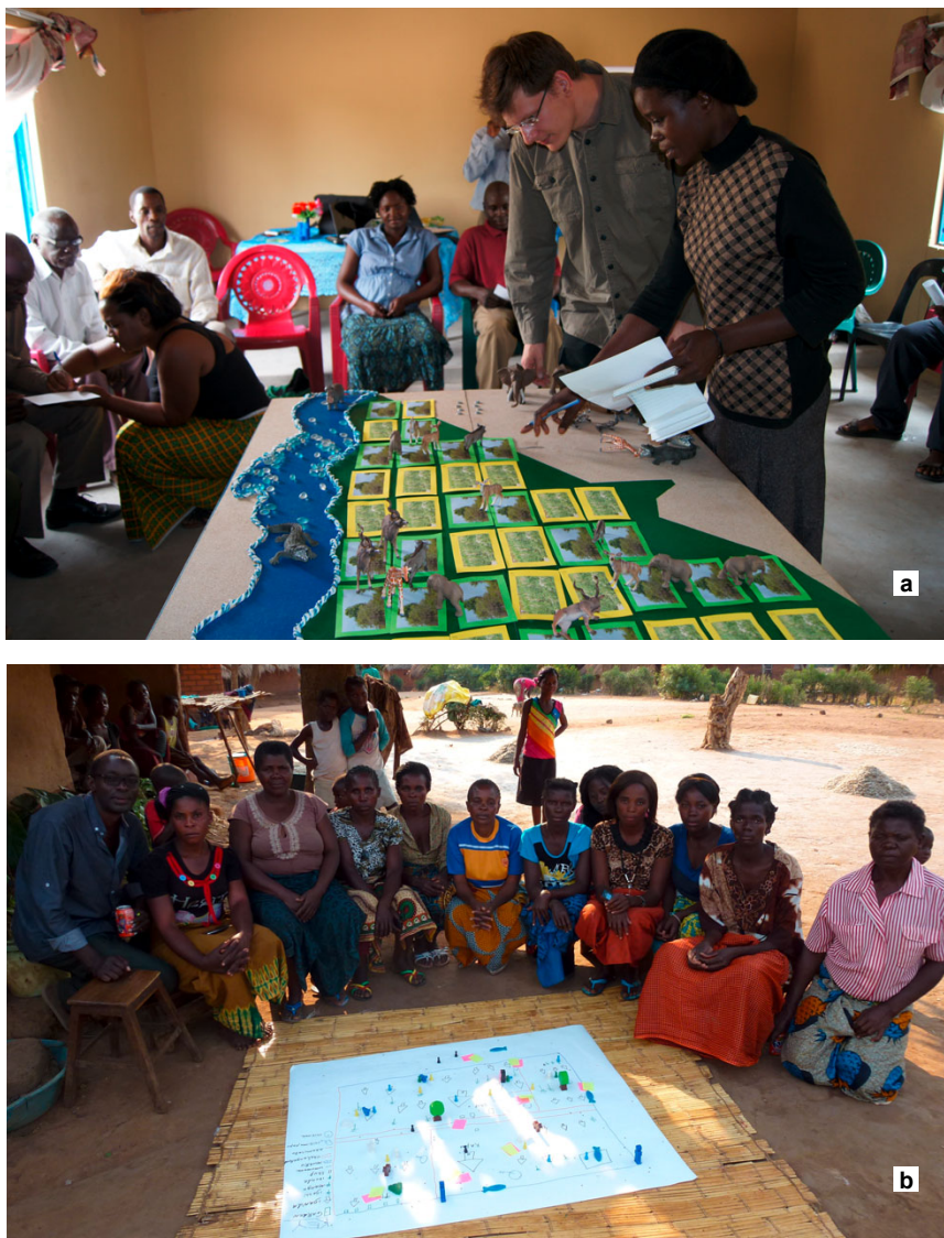
Figure 2: Role play in a community meeting (a); participatory mapping with a women's group (b).

which in turn can advise decision-making (Perrotton et al., 2017; Purnomo et al., 2009; Röttgers, 2016; Salvini et al., 2016; Speelman et al., 2014; Villamore et al., 2014).