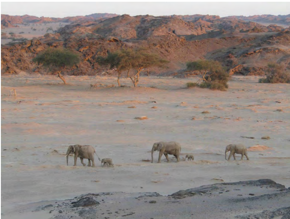
Figure A3. Two of the three surviving calves born in Hoanib in 2019.