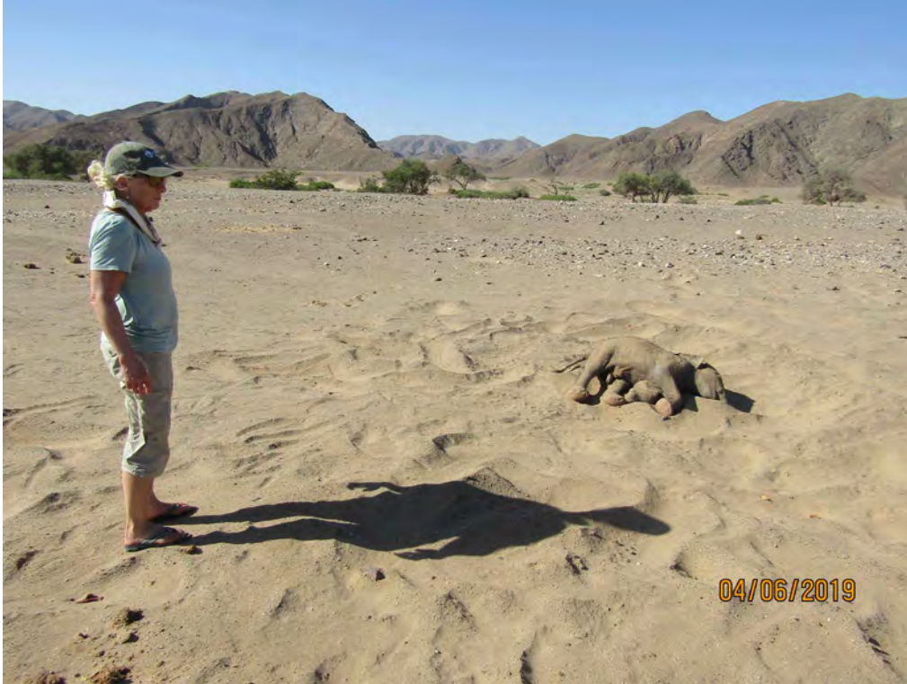
Figure A2. Seven elephant calves were born in Hoanib River between Jan-May 2019. Three died shortly after birth and one was removed for captive-rearing when his mother died suddenly. Three were alive and well in the Hoanib River as of end 2019.