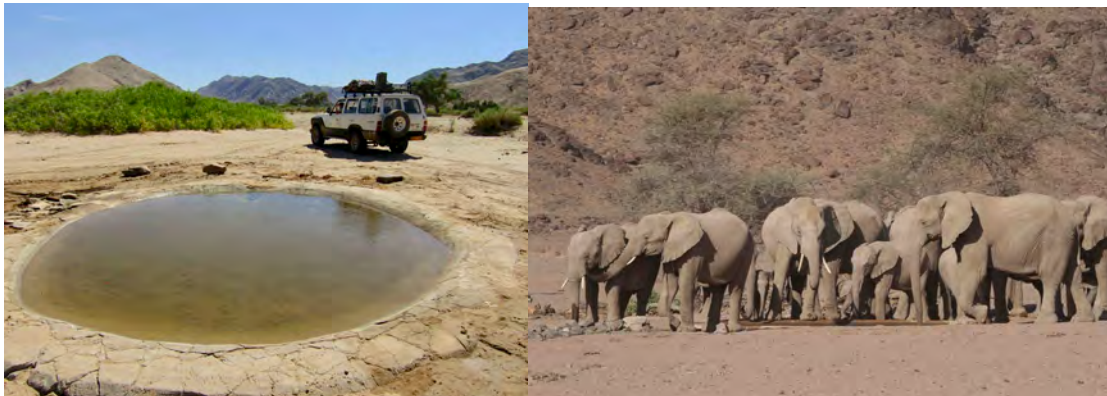
Figure A5. Boreholes are critically important for desert elephant survival in the Hoanib River. Both the borehole at Natural Selection's Hoanib Valley Camp and Wilderness Safaris Hoanib Skeleton Coast Camp provide valuable drinking opportunities for the resident breeding herd and supplement the Presidential Boreholes. Tourism at these camps and others nearby lead to increased protection for the elephants and other wildlife, as well as jobs and income for people in the local communities, adding value to wildlife.