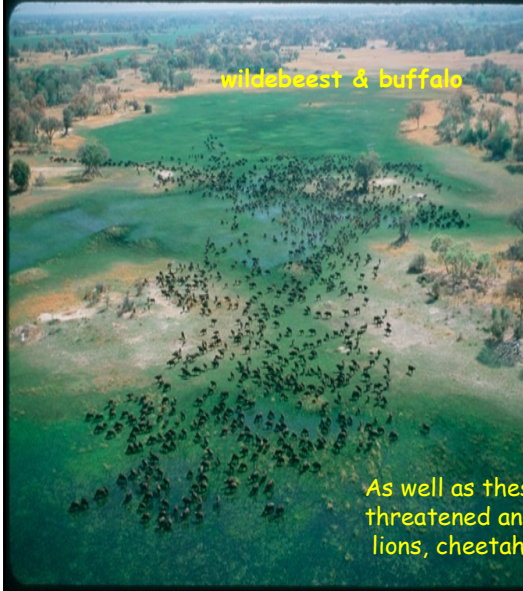
wildebeest & buffalo