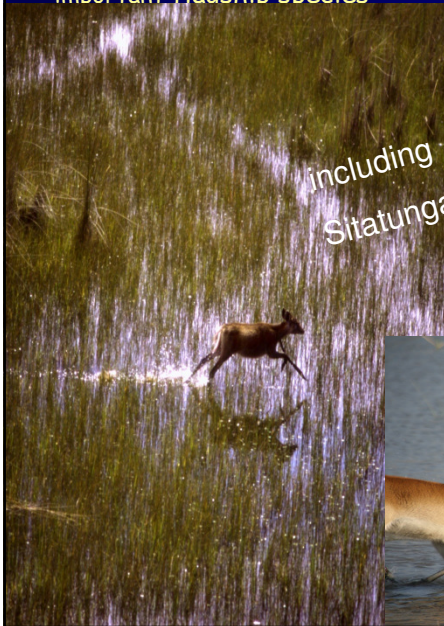
including Sitatunga, Lions

The delta is also a wetland oasis for many ecologically important flagship species