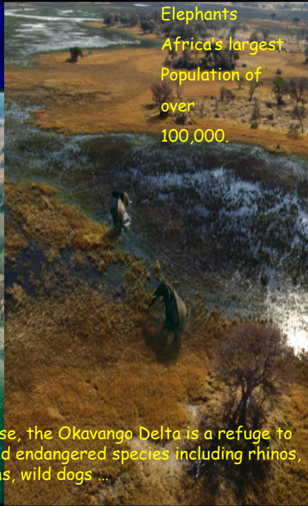
Elephants Africa's largest Population of over 100,000.