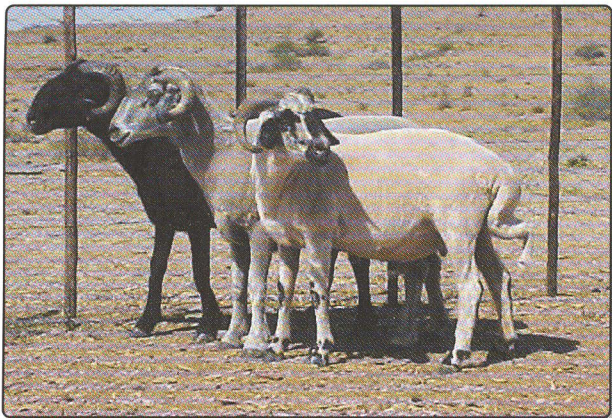
Different colours of Karakul sheep

THE GELLAP-OST KARAKUL STUD HAS BEEN THE NUMBER ONE KARAKUL STUD IN FERTILITY IN NAMIBIA FOR THE PAST FOUR CONSECUTIVE YEARS