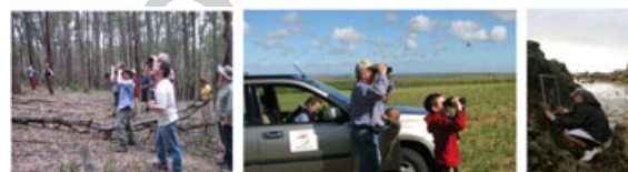
Photo captions: Community biodiversity monitoring in southeastern Australia and southern Africa. Monitoring the New Zealand intertidal zone.

understanding of the science of climatic change by tracking selected plant and animal indicator species and their behaviour throughout the year. The project recognizes that successful data collection on this scale is only possible through multi-sector input and an approach that engages the community in the scientific process with the data collected being freely available to all through the Atlas of Living Australia ( http://www.ala.org.au ). The format of data collected allows scientists to look not only at changes in the phenology of species but also at range shifts.