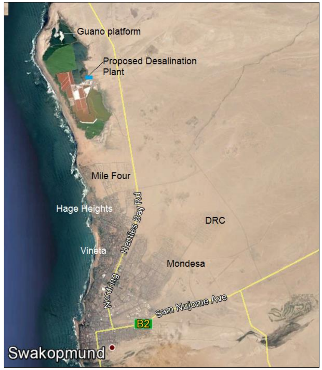
Figure 1. Site of Proposed project in relation to Swakopmund

The desalination plant will be approximately 60m x 20m x6m high, while the post treatment and pretreatment plants, and the storage tanks would be located adjacent to the plant building. The equipment room, offices, and chemical storage room would also be housed in a 13m x 20m x 6m high building that is connected, or is immediately adjacent, to the main plant building.