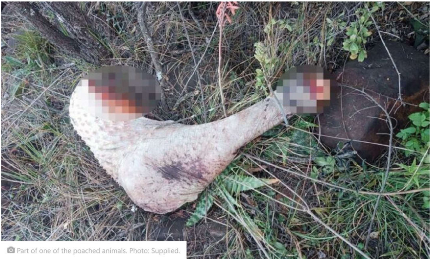
Part of one of the poached animals.

Three farm workers have been detained for being in possession of dagga as well as parts of different poached animals. This comes after anti-poaching unit members came upon fresh blood and intestines.