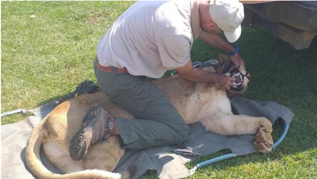
The animals were removed and taken to a sanctuary.