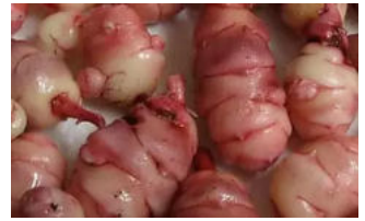
Diabetes Is Not From Sweets: Meet The Enemy Investing Magazine

Controversy was sparked following the tiger's recapture that same day, with the SPCA saying they had no knowledge about it.