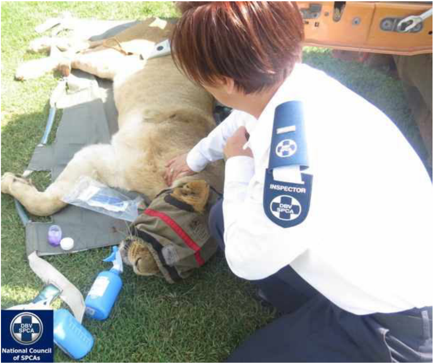
The NSPCA condemned the keeping of wild animals in captivity.