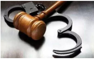
Two handed life sentences after boyfriend raped,...