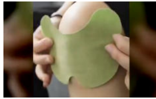
Bone on Bone Knee Pain? Try This, Says Top Doc! getmrjoint.com