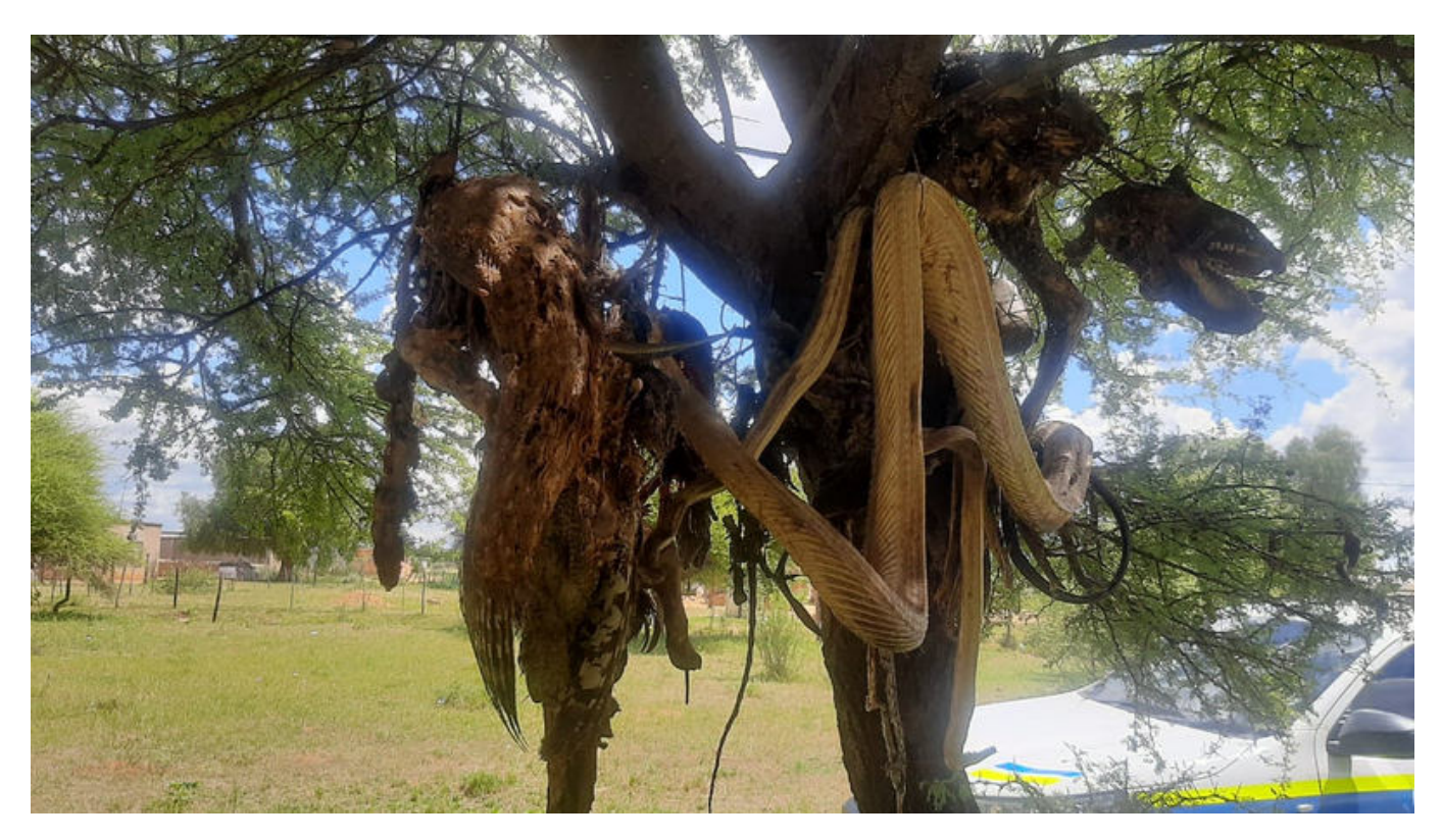
A man from Lesotho was arrested for possession of the endangered species. Published 9h ago