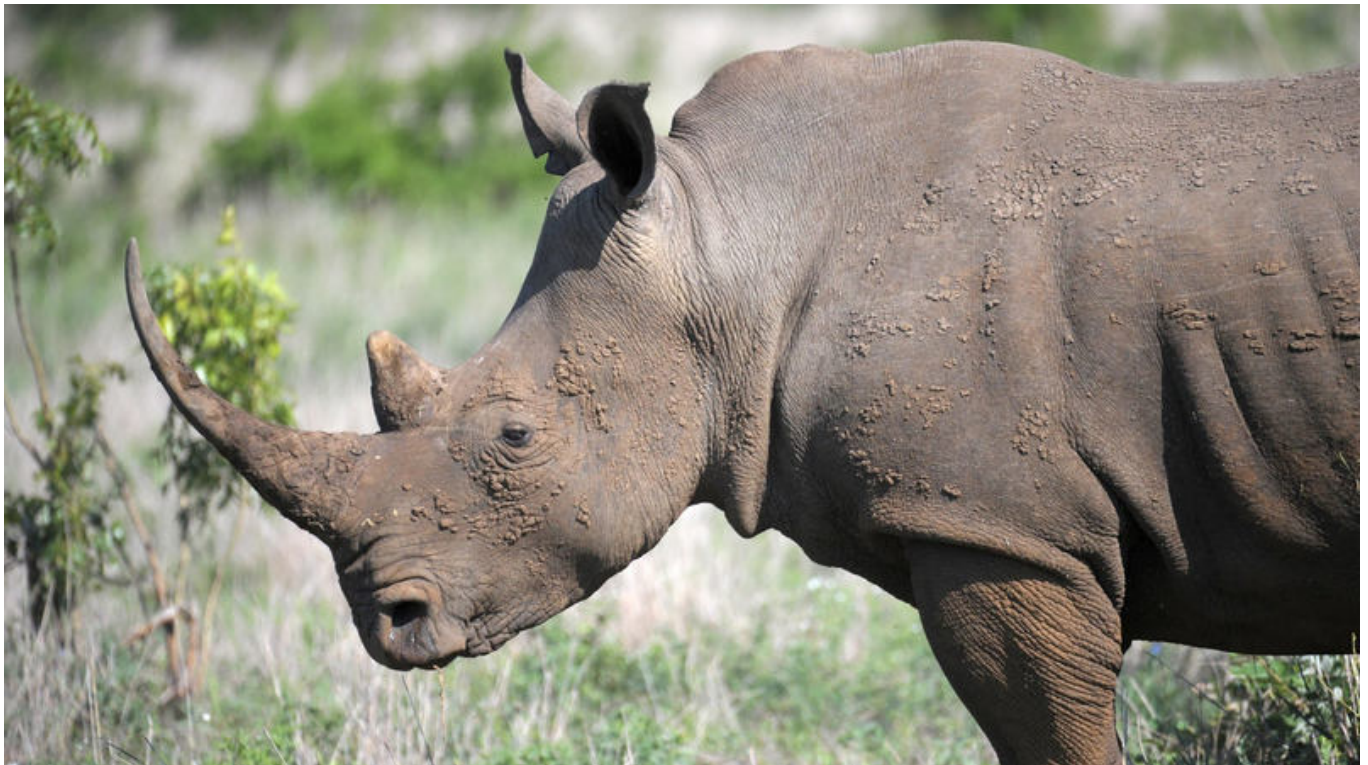
As many as two rhinos a day get poached in Kruger National Park alone.