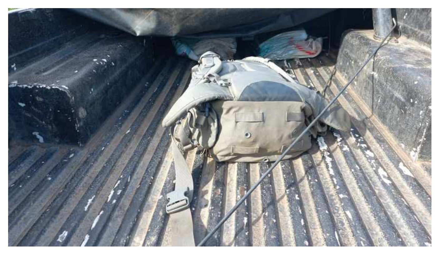
A field ranger was arrested after he allegedly hid two suspected poachers in his bakkie.