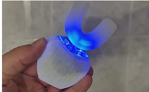
Incredible: seniors are snapping up... Teeth Care