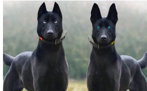
The 25 Most Expensive Dog... Investing.com