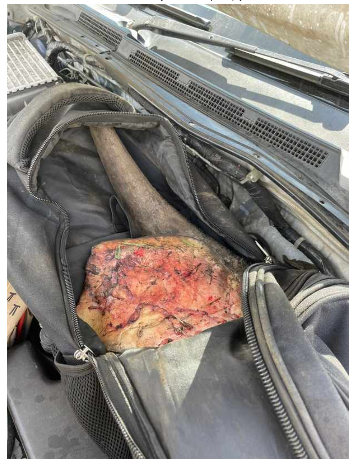
Two men have been remanded in custody after they were allegedly found with 14,6 kilograms of rhino horns hidden in the engine compartment of a Toyota Fortuner.

In October, a 42-year-old man was arrested by members of the Middelburg K9 Unit after a black plastic bag, with two rhino horns valued at about R2 million was allegedly found in his vehicle.