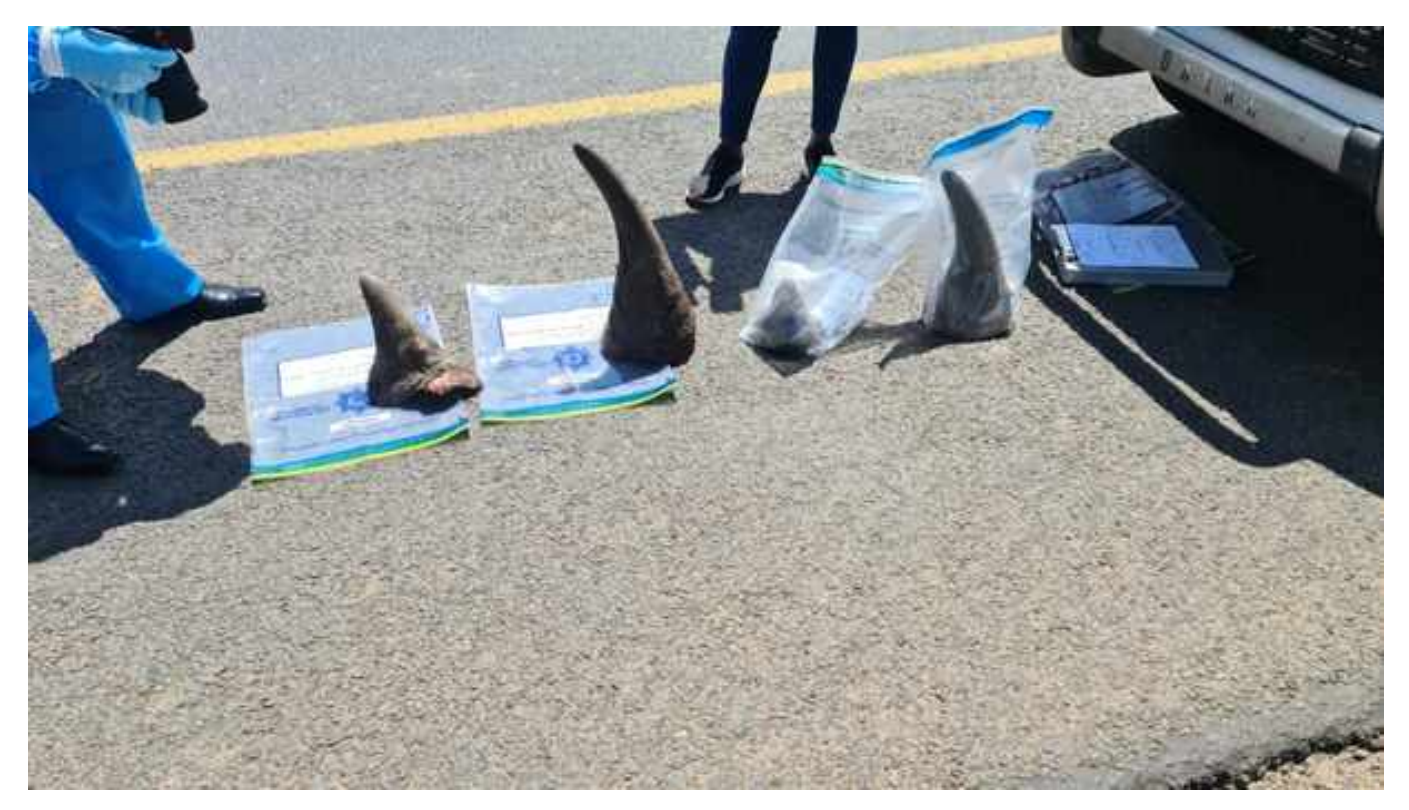
Two men have been remanded in custody after they were allegedly found with 14,6 kilograms of rhino horns hidden in the engine compartment of a Toyota Fortuner.

The Secunda-based Hawks' serious organised crime investigation team was called, and arrived to process the crime scene.