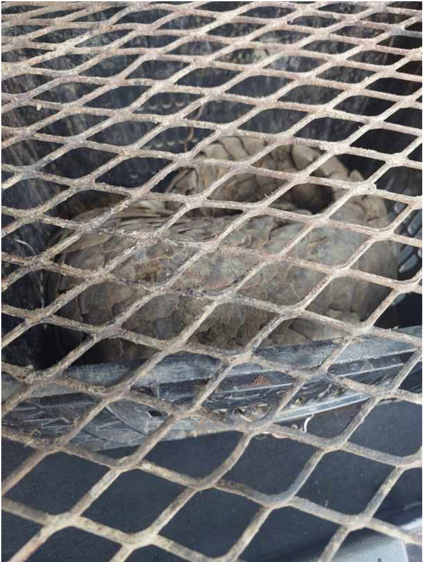
Six people have been remanded in custody after they were found in possession of a pangolin in their car.

“The accused's court appearance emanates from their apprehension on Saturday, 10 December 2022, at a garage in Zeerust, for possession of a pangolin. That was after