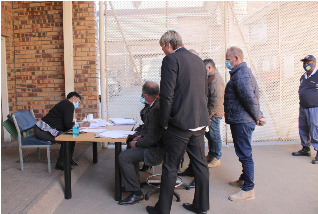
The set-up for proceedings at the Nelspruit Police Station.

They were released on condition that they report to their local police stations once a week and that they do not communicate with any witnesses.