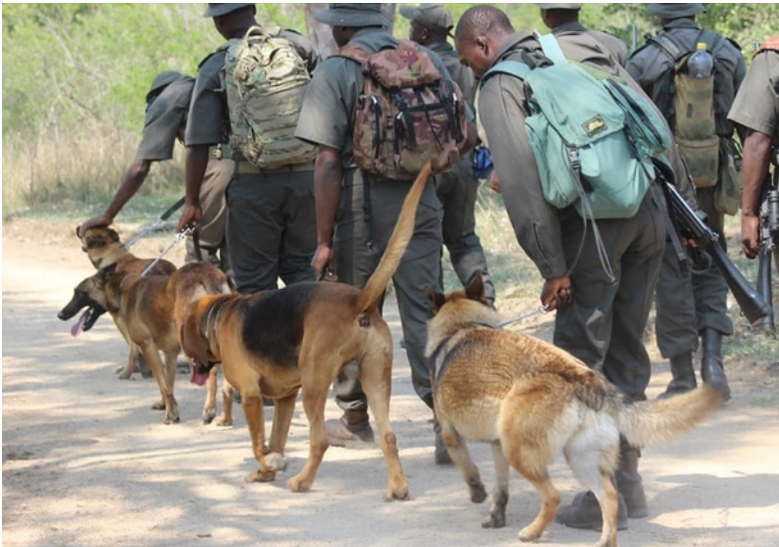
The South African National Parks (SANParks) rangers arrested three suspected poachers near the Crocodile Bridge Section of the Kruger National Park (KNP).

“It was another long day in the field for our anti-poaching teams in difficult conditions. They displayed tenacity and excellent teamwork. The arrests bring the number of those arrested in the past five days to eight. This time three rifles, ammunition and hunting equipment were seized boosting the morale of the rangers, aviators and K9 Unit in the battle to protect and conserve rhinos in the KNP which has borne the brunt of attack from international rhino-poaching syndicates,” Phaahla explained.