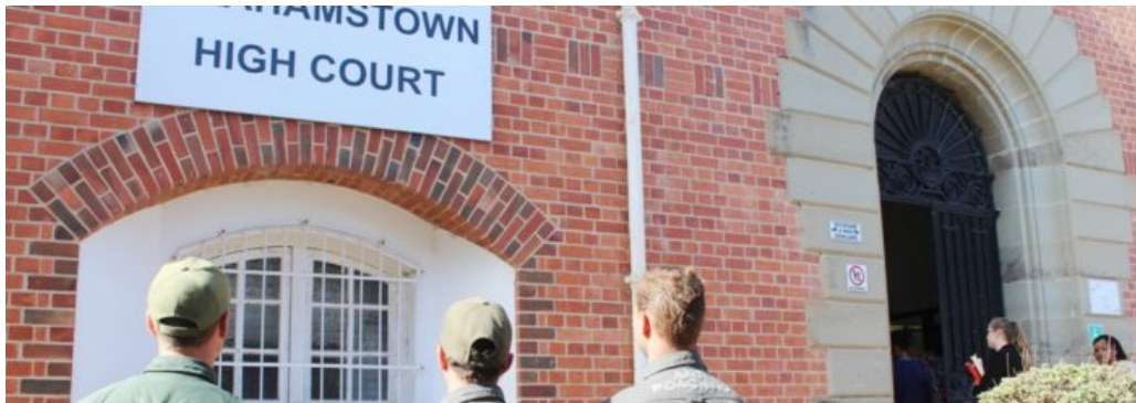
Members of the Lalibela reserve anti-poaching unit pose for a photo outside the High Court in Makhanda (Grahamstown) ahead of the sentencing of the Ndlovu rhino-poaching gang on 3 April 2019.

YOU ARE AT: Home » NEWS » Poaching trial to resume in May