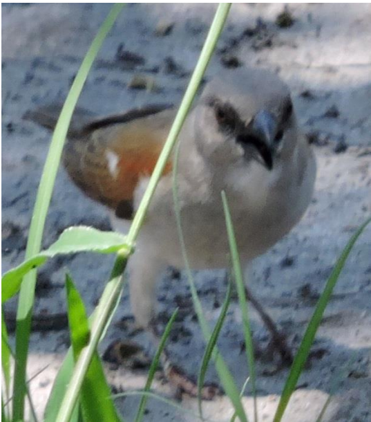
Figure 6: Northern Grey-headed Sparrow

Wilfried and Sibylle Hähner also found Red-headed Queleas in both the Kwando Core Area of the Bwabwata National Park and the Mudumo National Park at about the same time.