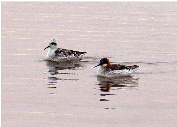
Figure 3: Red-necked Phalarope

Twenty four Red-necked Phalaropes were counted in the saltworks at Walvis Bay in the course of the water bird count there on 10 February 2019.