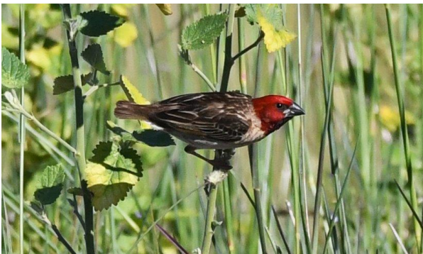
Figure 7: Red-headed Quelea

Wilfried and Sibylle Hähner also found Red-headed Queleas in both the Kwando Core Area of the Bwabwata National Park and the Mudumo National Park at about the same time.