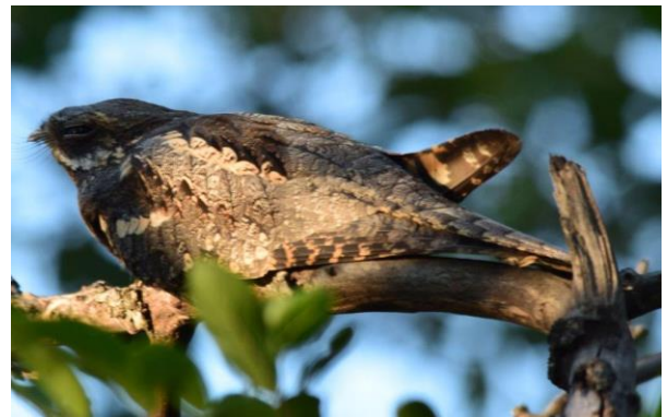
Figure 8: European Nightjar

the vicinity of the Kupferberg landfill site on 01 March 2019.