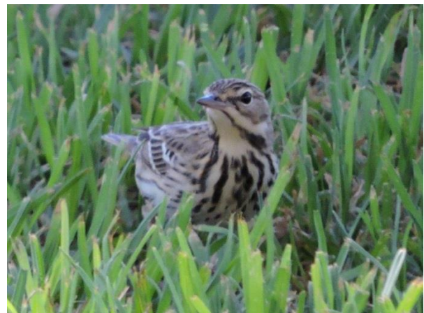
Figure 16: Tree Pipit

A picture of African Skimmers seen in the vicinity of Zambezi Mubala Lodge circa the last week in April 2019 was posted on the Birds of Namibia Facebook page. The presence of this species at this time of the year can only be due to the extremely low level of the Zambezi River (See also above).