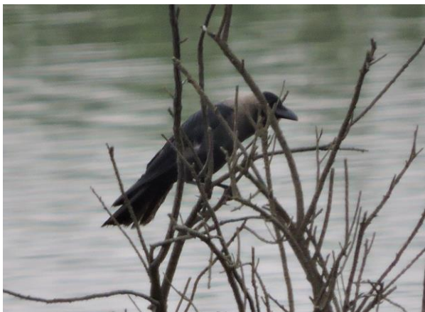
Figure 4: House Crow

Rather disconcertingly, a House Crow was seen at the Walvis Bay sewage ponds on the same day. This invasive alien species has been recorded several times previously at the central coast.