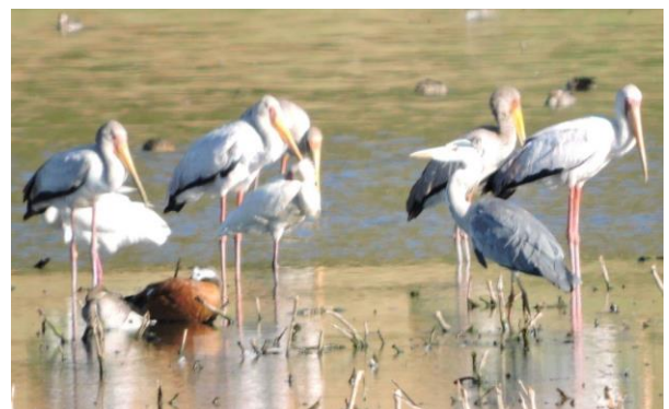
Figure 9: Yellow-billed Storks

A morning walk at Avis Dam with visiting birder Richard Thompson on 03 March 2019 turned up a Glossy Ibis, four Marabou Storks and no less than ten Yellow-billed Storks. I was informed by Walther Hanke that there had been 100+ Marabou Storks there earlier in the week.