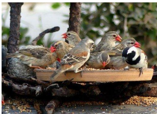
Figure 17: Red-billed Queleas

On 21 May 2019 Rian Jones posted pictures on the Birds of Namibia Facebook page of two Swallow-tailed Bee-eaters which had rather surprisingly appeared on Mercury Island where they had remained for several days.