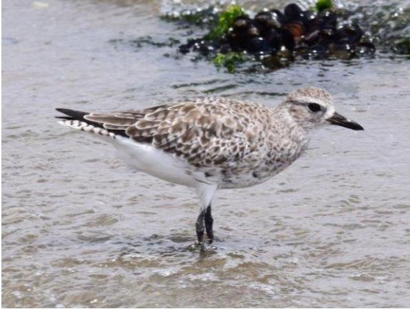
Figure 10: American Golden Plover

Two American Golden Plovers were seen at Walvis Bay by Paul Gascoigne and Helen Pooley on 11 March 2019, one near the Protea Hotel and the other near the pump station on the Paaltjies Road.