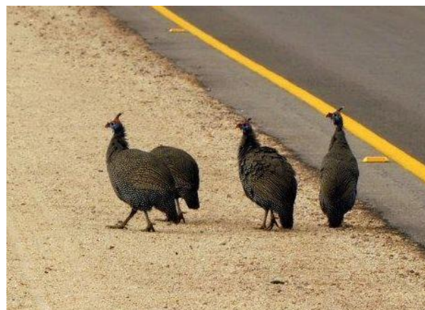
Figure 18: Helmeted Guineafowl © Eckart Demasius

Eckart Demasius was extremely surprised to find a small flock of Helmeted Guineafowl next to the road at Mile 8 on 28 May 2019.