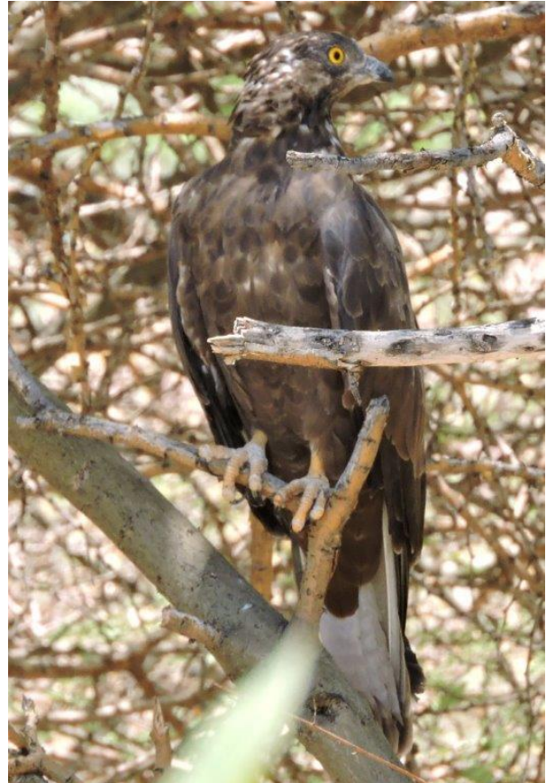
Figure 2: European Honey Buzzard

species occurring in central Namibia) at Okombahe.