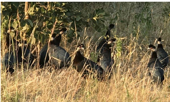
Figure 14: Crested Guineafowl

Lise Hanssen found a group of at least ten Crested Guineafowl about 30 km east of Kongola on 04 April 2019.