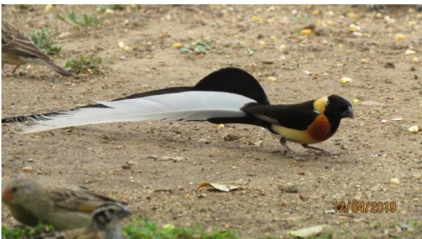
Figure 15: Long-tailed Paradise Whydah

Eckart Demasius found a flock of about ten Black-throated Canaries at Wlotzkasbaken on 08 April 2019 (this seems to be a new species for SABAP2 in this extremely well atlased pentad) and the following day he saw both Black-headed Heron and Southern Masked Weaver in the Wlotzkasbaken vicinity, both unusual species in that area.