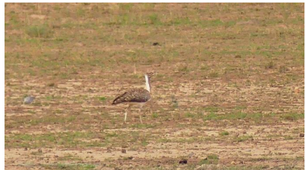
Figure 13: Ludwig's Bustard © Eckart Demasius

Eckart Demasius informed me of his sighting of a flying Bat Hawk in Eros on 22 March 2019 although a subsequent search for the bird at the old roost in von Eckenbrecher Street proved futile. Eckart also reported at least ten Ludwig's Bustards at Farm Krumhuk some 20 km south of Windhoek on 24 March 2019.