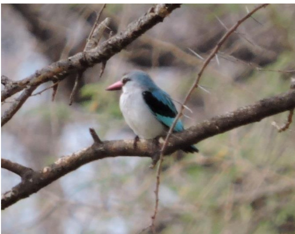
Figure 1: Woodland Kingfisher

A Woodland Kingfisher was seen at Farm Monte Christo in the course of the wetland bird count there on 02 February 2019. This is at least the tenth consecutive summer that this species has been recorded there, well south of its recognized range. Other interesting sightings at Monte Christo included a Greater Painted Snipe and a Martial Eagle.