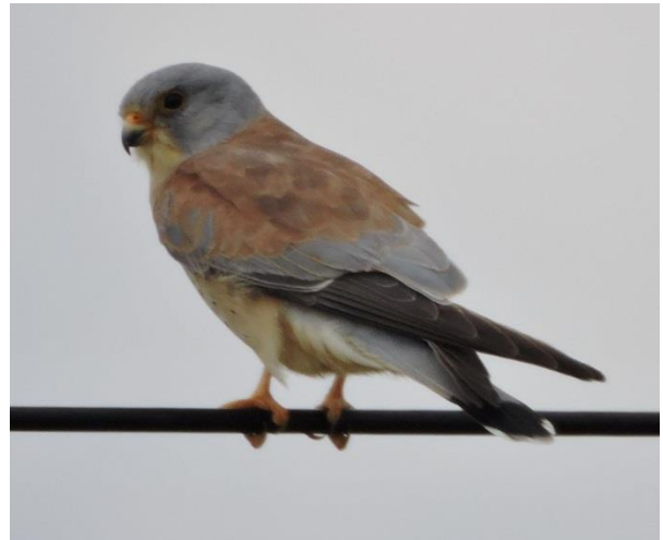
Figure 12: Lesser Kestrel

The Namibia Bird Club's atlasing bash in the Hochfeld area from 21 to 24 March 2019 turned up sightings of Lesser Kestrels on at least two different pentads while Gudrun Middendorff saw a pair of Red-billed Firefinches in Hochfeld, further evidence of the rapid range extension of this species in central Namibia.