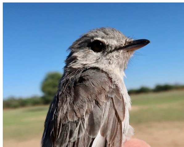
Figure 5: Ashy Flycatcher

Ursula Franke-Bryson caught and ringed a very far off range Ashy Flycatcher at Farm Hamakari near the Waterberg on 21 February 2019.