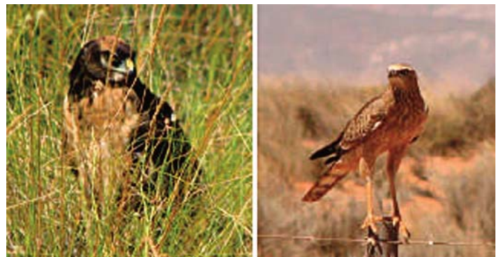
The juvenile Black Harrier (left) may be confused with the juvenile Southern Pale Chanting Goshawk (right)