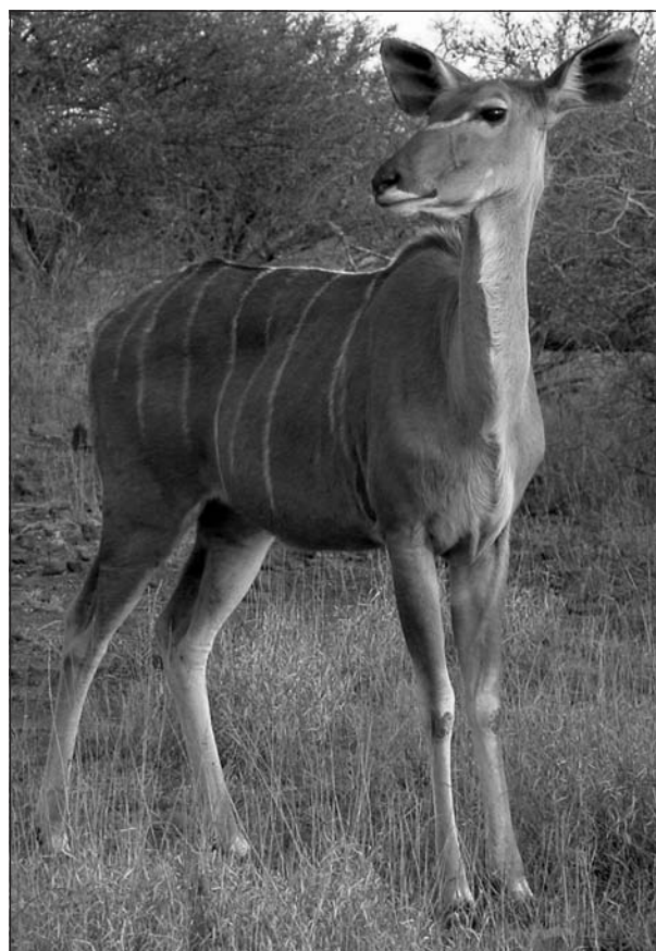
FIGURE 1: A Greater Kudu ( Tragelaphus strepsiceros ) cow.

son within reach. The time taken for the healthy deer to become infected and show clinical symptoms was 19 days. The second unique occurrence of the maintenance of rabies among a non-carnivorous host species occurred in 1888 at Icksworth Park, Richmond, England, where an estimated 450 of a herd of 600–700 fallow deer ( Dama dama ) died (Adami 1889). These fallow deer showed similar symptoms to those noted by Cope (1888) in the roe deer in 1885.