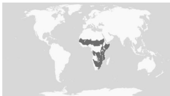
Figure.5: Quelea migratory sequence