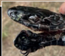
Boomslang Melanistic Coloration