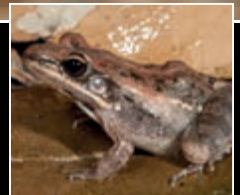
Mapacha Ridged Frog Distribution