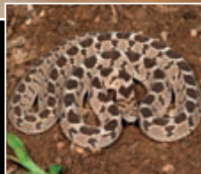
Montane Egg-eater Diet and Distribution