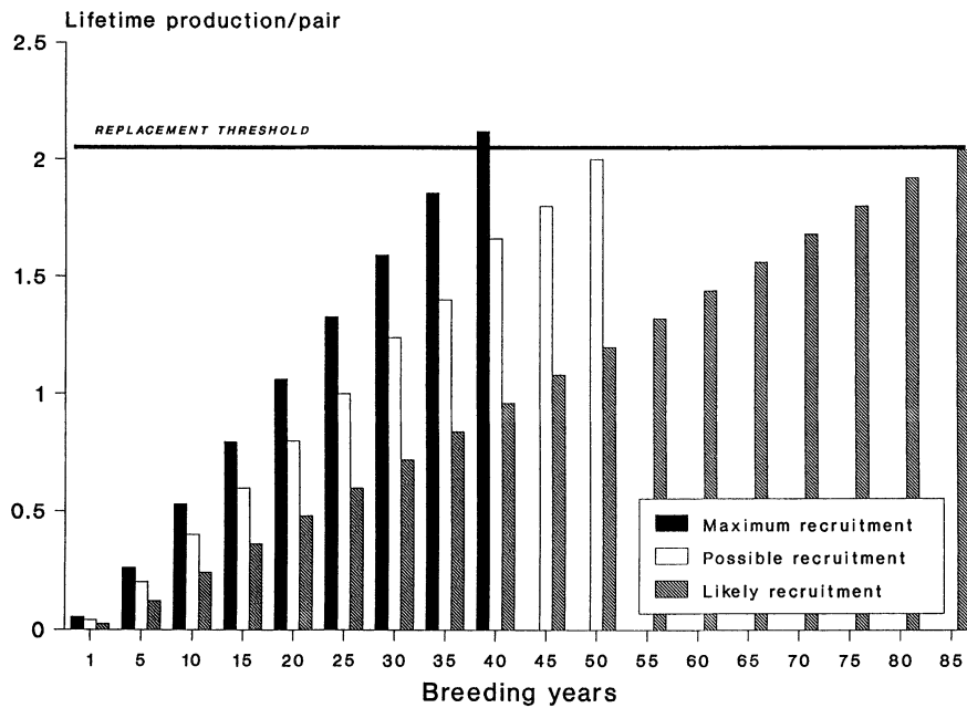
Figure 2. The number of years that flamingo pairs need to breed at Etosha in order to replace themselves (to produce 2.0 young). Three recruitment levels are shown: maximum recruitment (100% fledgling survival and all suspected breeding successful), possible recruitment (100% survival and suspected breeding unsuccessful), and likely recruitment (46% survival to adulthood and suspected breeding unsuccessful).

though breeding attempts by Lesser Flamingos have been relatively high in the last 5 of 7 years (T. Liversedge, personal communication). As it becomes better known this unprotected colony may face threats from sightseers on four-wheel motorbikes. Similar disturbances leading to breeding failure occur elsewhere (Allen 1956; Johnson 1989) and have prompted swift and long-term intervention in Europe (Johnson 1975). The Botswana pans have experienced slightly higher rainfall and more flamingo breeding attempts than Etosha recently, but they suffer the same rapid drying and reproductive failure apparent in Etosha. For example, no recruits occurred at the Namibian wintering grounds following reports of 30,000–40,000, Lesser Flamingo chicks about 1 month old in 1994 (last Botswana aerial census [T. Liversedge, personal communication]). Because water on the pan was then scarce it is likely that all young died of starvation after the survey. Thus, Etosha Pan is possibly the only undisturbed, pollutant-free, formally protected flamingo breeding site in Africa, yet it is a nonviable breeding ground.