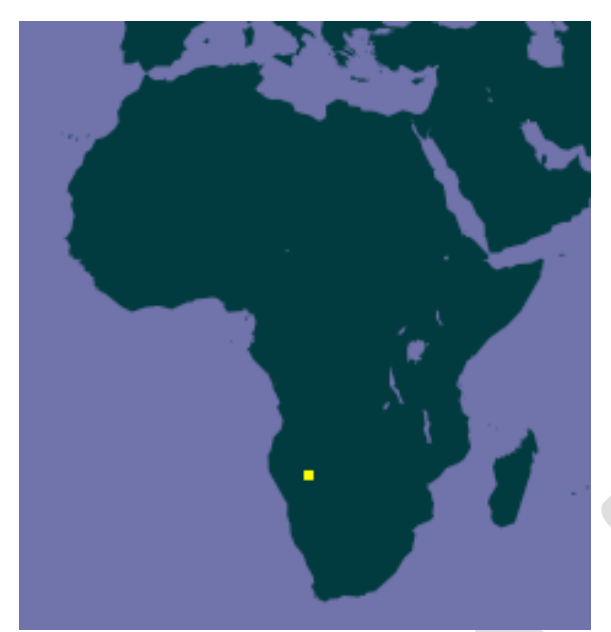
Figure 1. Global distribution of T. guinasana . Map from GBIF (2014).