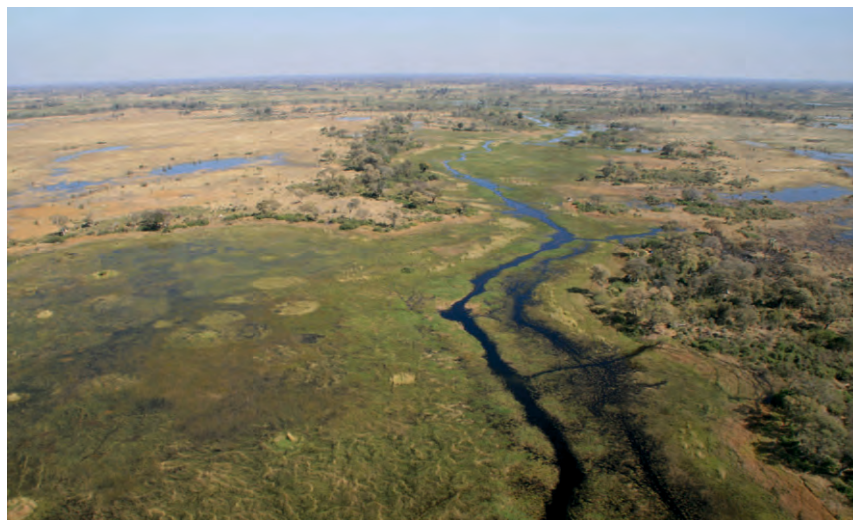
Fig. 1: The Okavango Delta in August 2009.

The Cubango River (flow length of 1,260 km) has its source in the eastern part of Huambo Province close to the village of Tchicala Tcholohanga (1,850 m above sea level (a.s.l.)), whereas the Cuito River (flow length of 920 km) rises between Cangoa and Sachiambe (1,430 m a.s.l.) in the western part of Moxico Province (Fig. 2). After the confluence of both rivers south of Dirico the river becomes the