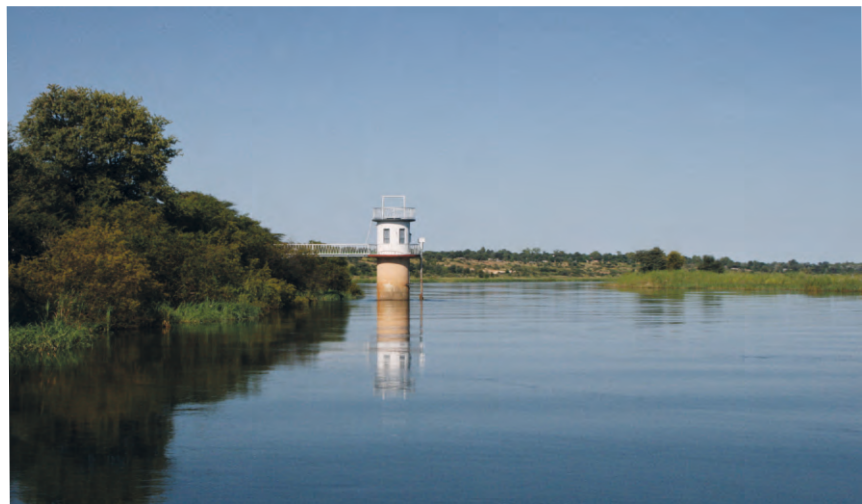
Fig. 5: Gauging station at Rundu.

Mainly because of civil war in Angola, which ended in the early 2000s, and the high prevalence of insect-borne diseases