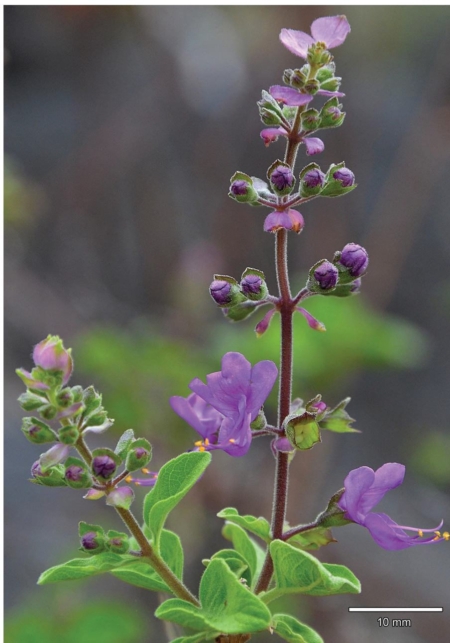
FIGURE 3. Ocimum sebrabergensis . Inflorescences.