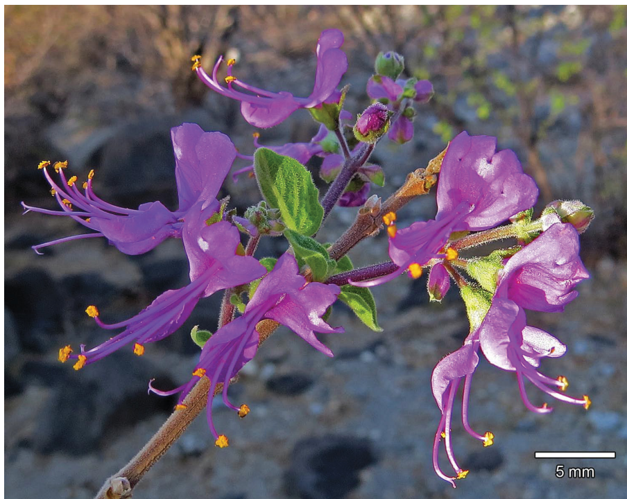
FIGURE 4. Ocimum sebrabergensis . Flowers.

Phenology: —Flowers were recorded during midsummer (November to January).