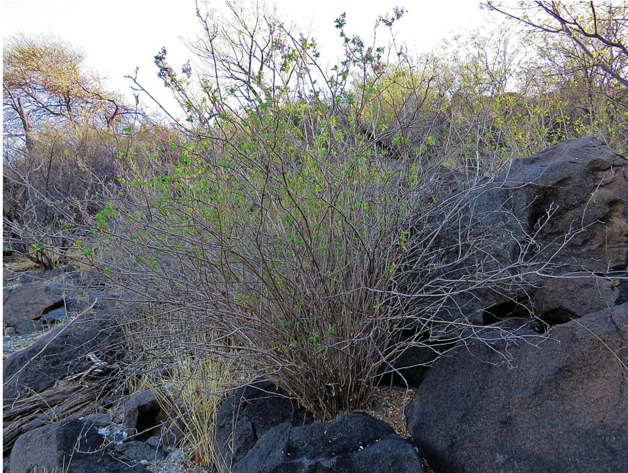
FIGURE 1. Ocimum sebrabergensis . Plant in natural habitat among greyish black boulders of anorthosite, growing as a shrub about 1.8 m tall.

Type: —NAMIBIA. Kunene Region: Zebra Mountains, hill south of Okau, between boulders, 1713BC, 980 m, 12 November 2014, Swanepoel 339 (holotype WIND!; isotypes PRE!, PRU!).