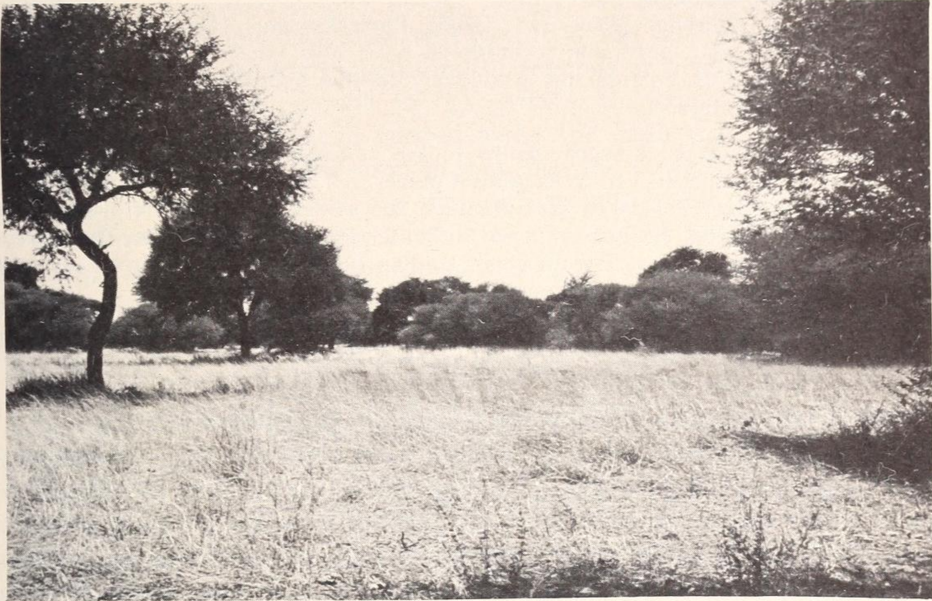
Fig. 4. Wooded savanna near the shore of the great Masetleng pan.