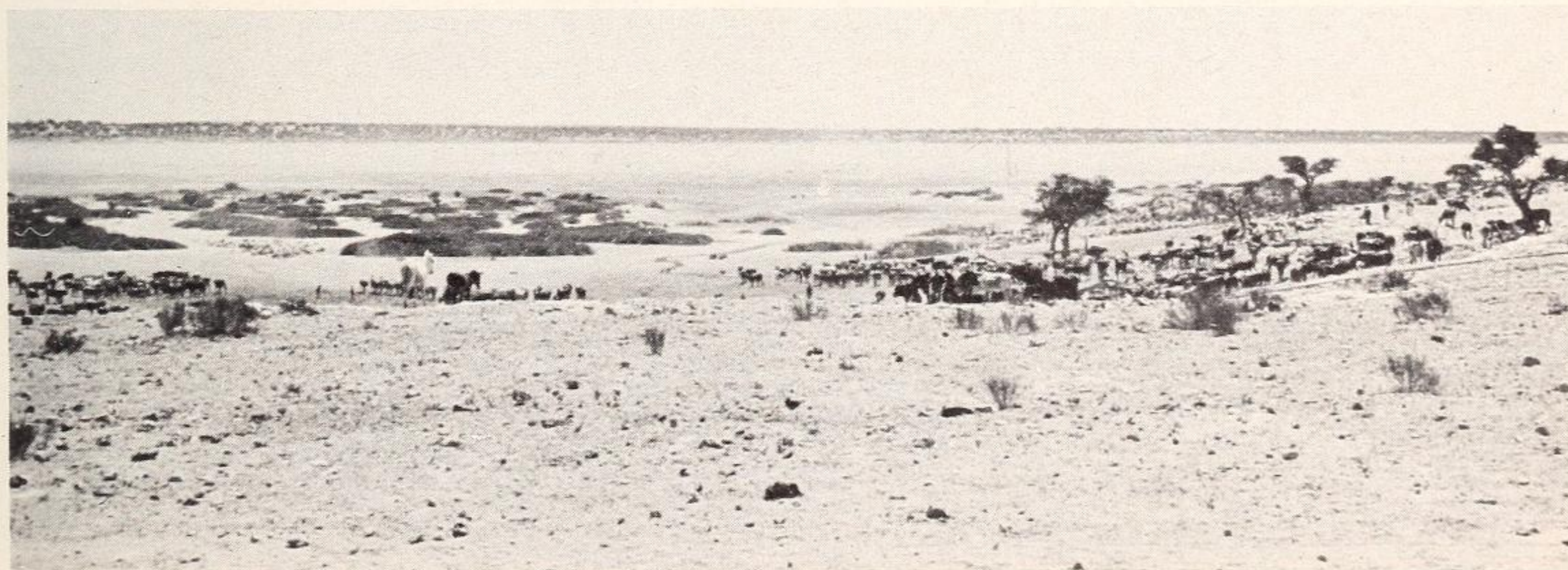
Fig. 2. Cattle and goat herds grazing at the shore of the dry Mabutsane pan.

As during the whole expedition I enjoyed the privilege of just sitting back in my seat while being driven around by my friends, I could fully concentrate on scenery and bird life and make notes, even while moving from camp to camp