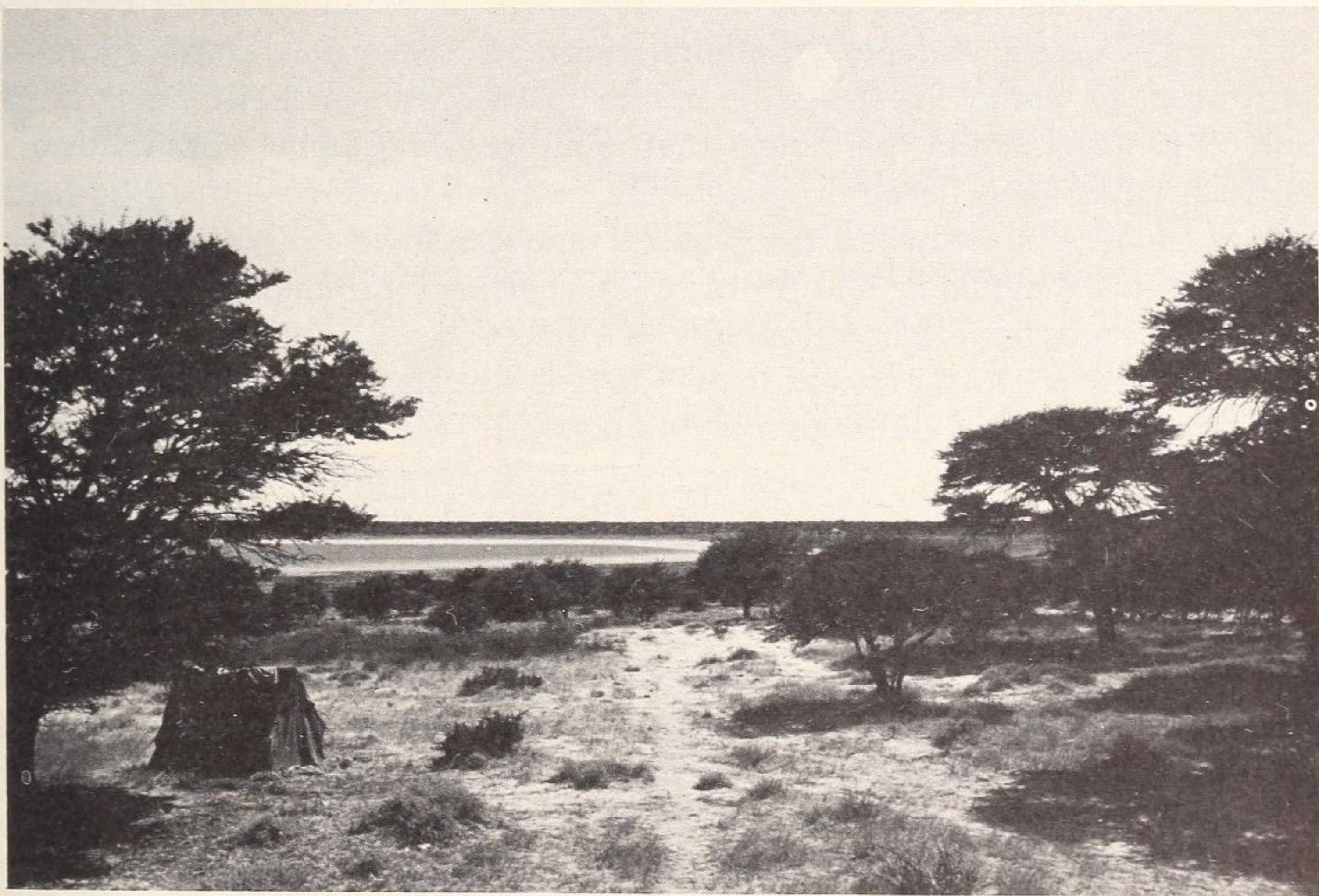
Fig. 5. Savanna bush between Tshane and Mabuasehube pan.