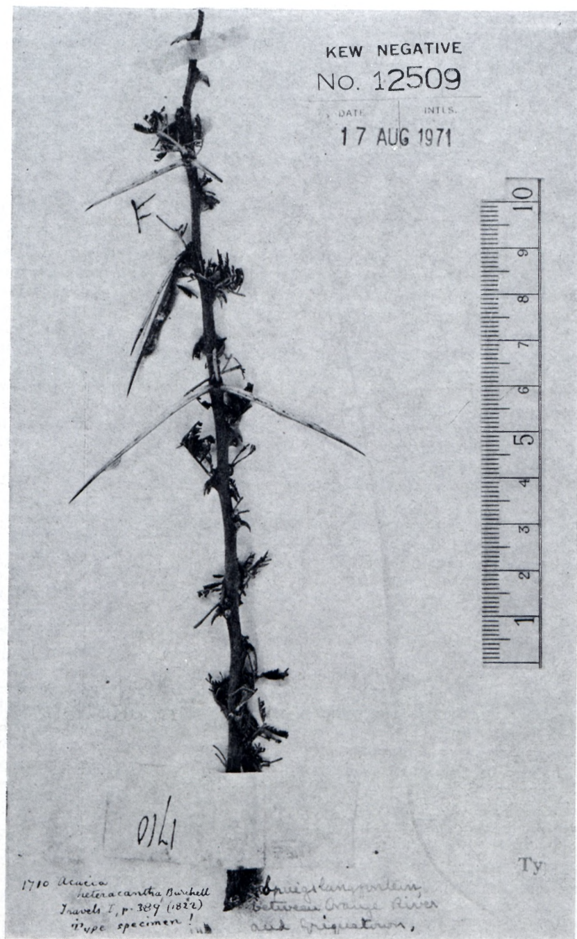
PLATE 1.—Burchell 1710, the type specimen of Acacia heteracantha (x 1).